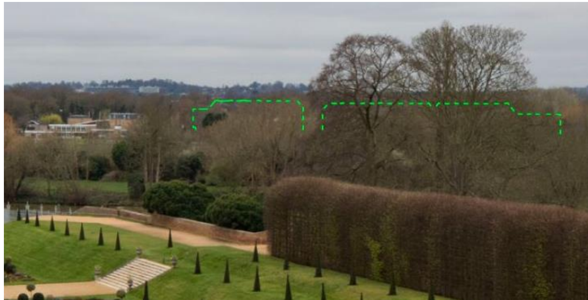
Extract wireline from above Privy Garden for Units 1 & 2 development