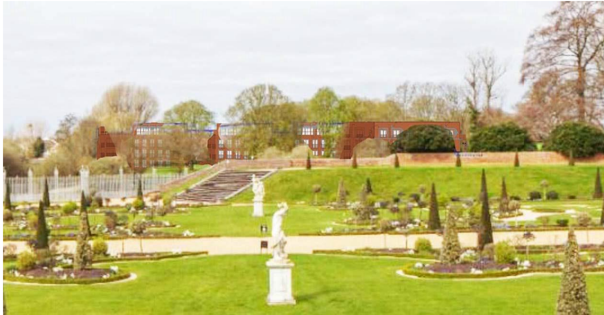
Montagu Evans/Miller Hare TVIA View 5