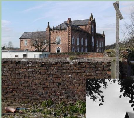
Over Tabley Hall 17 th C walled garden