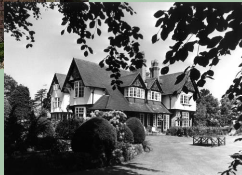
Meadowlands T H Mawson?