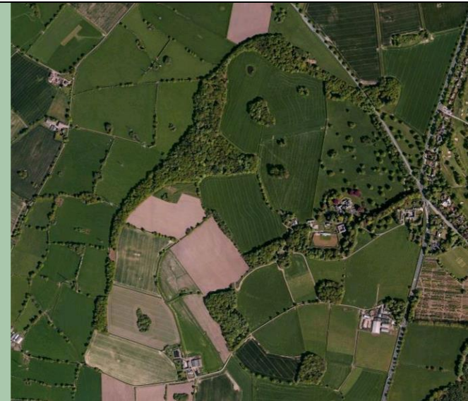
Old Mere Hall