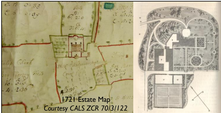
1721 Estate Map