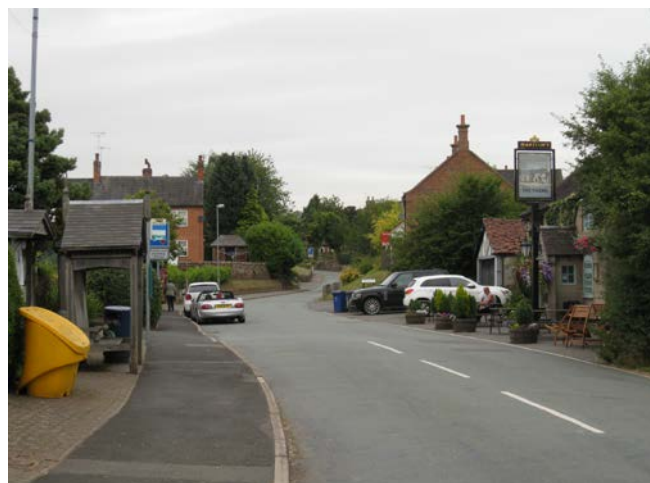
Figure 3 (top) What does the evidence tell us? Roundtable discussions on the local historic environment