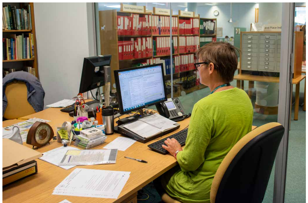
Figure 1: Responding to HER enquiries. © Lauren Alice Golding