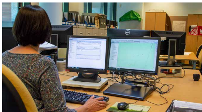
Figure 5: Consulting the HER database and GIS.

In addition, HER host organisations also need to provide adequate support for IT hardware and software (including GIS), and training opportunities in these for staff.