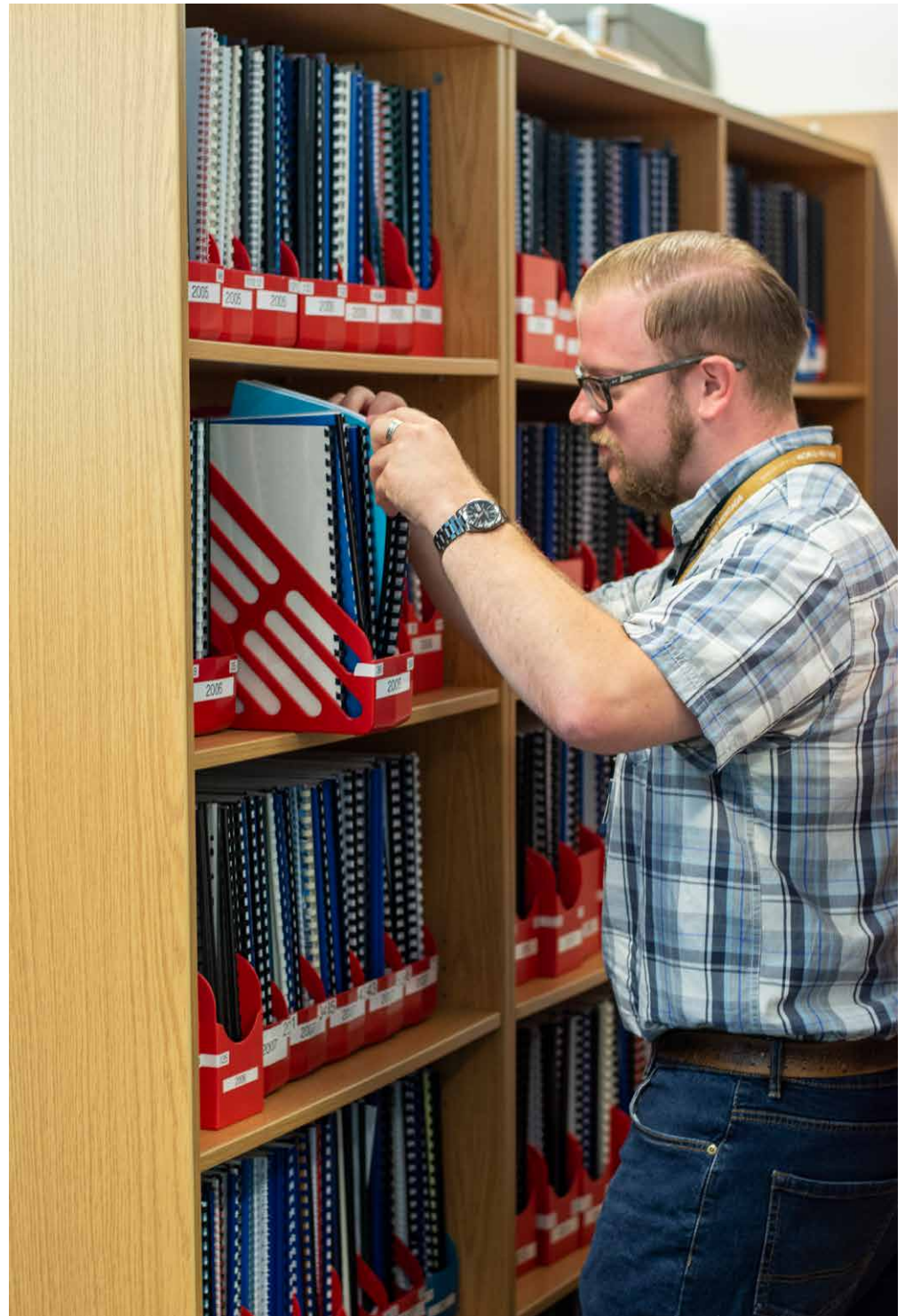
Figure 4: HER Officer using the reference collection.