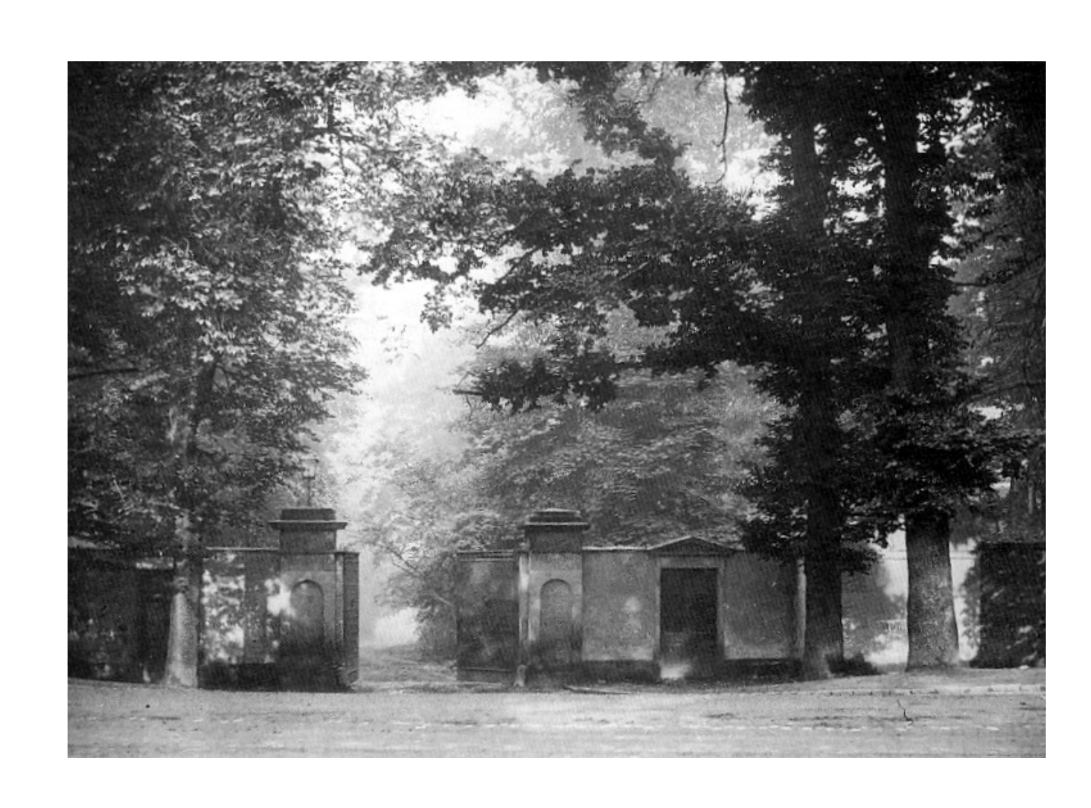
Photographs of the entrance and lodge of Moseley Hall, leading to the approach drive in the position suggested by Repton

It is initially surprising to see St Martins and St Philips (now the cathedral) churches visible from Moseley Hall. However even today it is possible to see the city centre and The Rotunda from the roof of Moseley Hall but I could not make out either of the churches, presumably due to later buildings. Closer to the Hall the extensive domestic buildings of Salisbury and Chantry Roads and tree planting on the former Moseley Hall Park have obscured the Pool, and reduced appreciation of the undulant nature of the terrain, so evident in Repton's watercolours.