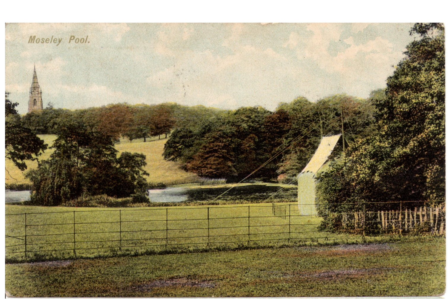
Views of the enlarged Pool, probably in the 1880's before the cutting of Chantry Road in 1890 but after the construction of St Anne's Church, consecrated in 1874.

Acknowledements All images from the Red Book are reproduced from transparencies supplied by the Fran-