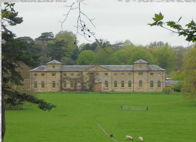
How the stables look today