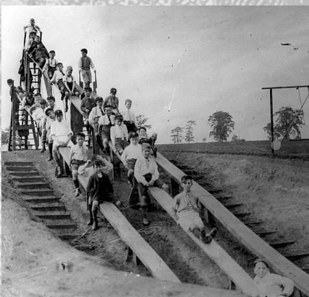
Early wooden slides at Wicksteed Park – no Health and Safety rules in those days!