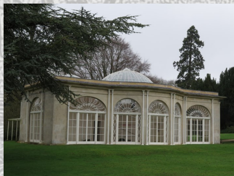
The Orangery today visible from Barton Hall Hotel

To find out more visit our website www.northamptonshiregardenstrust.org