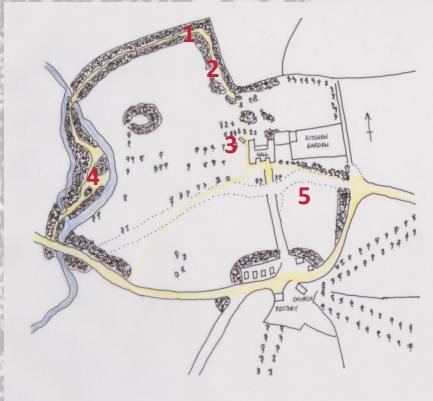
Sketch of plan from Red Book

The upwardly mobile commission 'A Gentleman's Residence' 1