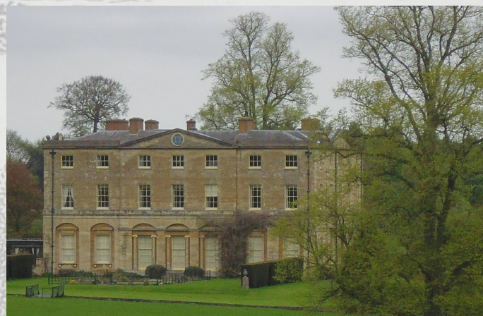
The rebuilt Courteenhall House as it looks today