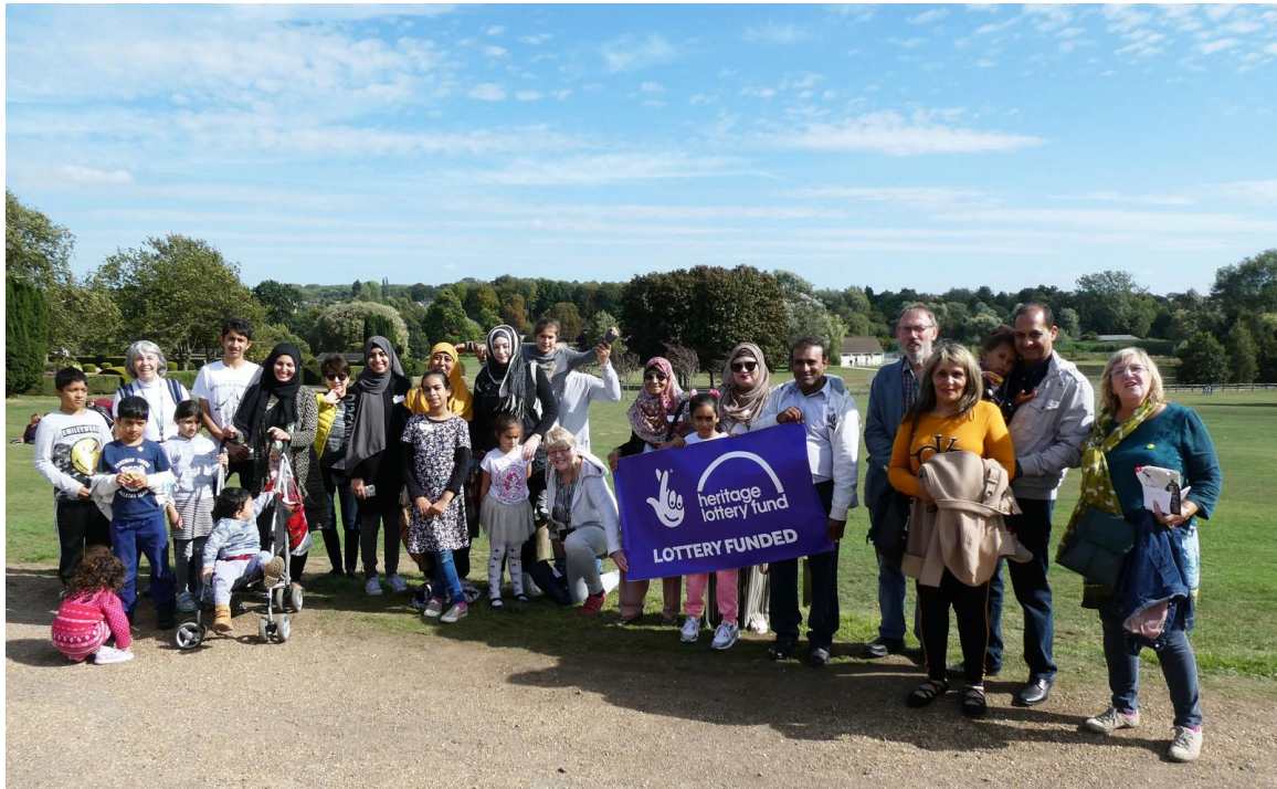
Guests and volunteers at our family excursion to Wicksteed Park, Kettering

It would be greedy to keep historic parks and gardens to ourselves, so the Gardens Trust is delighted to be working with volunteers and sites to share our passion with diverse local communities and create new friends and supporters for these heritage assets.