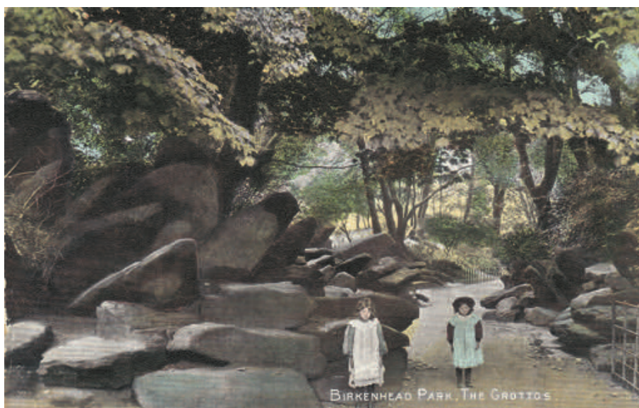
Figure 2. The Rockery (or Grotto), Birkenhead Park, which was formed from soil excavated for the Lower Park lake with rocks taken from the River Mersey during the construction of Birkenhead Docks. Courtesy: Cavendish Archive, postcard, 1904

Sources: Wirral Archive Services, committee reports; Corporation of Birkenhead, A Statement of Receipts and Disbursements of the Corporation of Birkenhead for the Year ending March 25th 1887 (Birkenhead: Wilmer, 1887), pp. 58–9.