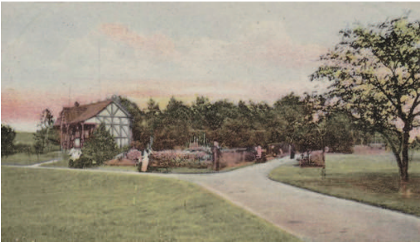
Figure 9. Mersey Park, Birkenhead, designed by Edward Kemp. unused postcard, pre-First World War

his established role. A new post, therefore, had to be created to manage the new facility.