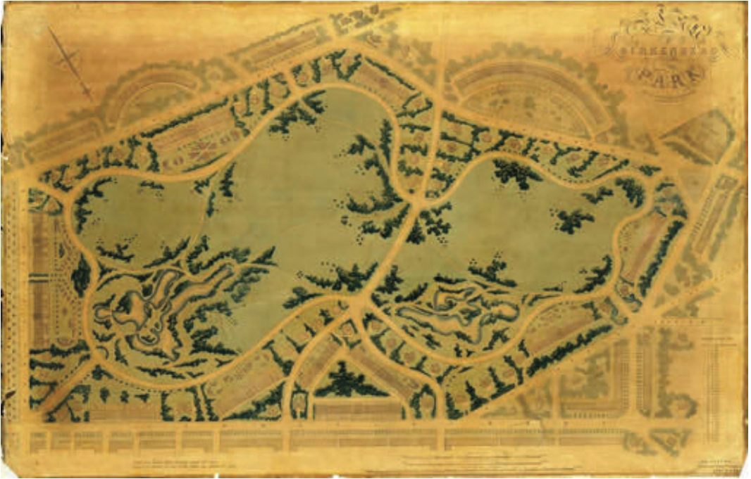
Figure 1. Joseph Paxton, plan of Birkenhead New Park, 1844.