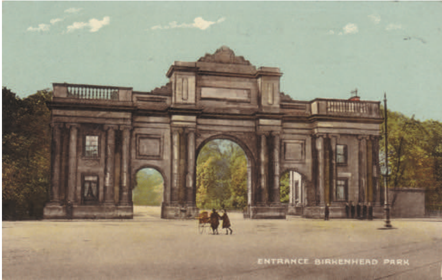
Figure 4. The Grand Entrance, Birkenhead Park, with a partial view of the North Lodge through the gates on the right-hand side. Courtesy: Cavendish Archive, postcard, 16 August 1925