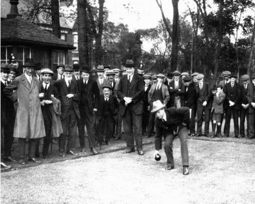
Figure 8. The Bowling Green, Birkenhead Park.