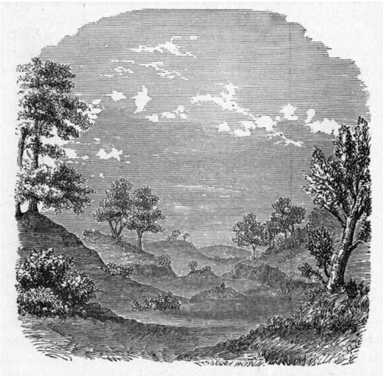
Figure 5. John Watkins Chapman, pictorial sketch of a picturesque landscape; from Edward Kemp, How to Lay Out a Garden , 2nd edn (New York: John Wiley & Son, 1901), fig. 89

Kemp's version of the gardenesque, which attracted praise in the Gardener's Chronicle review of How to Lay Out a Garden , was therefore complex and eclectic but also pragmatic and flexible, which helped to ensure its longevity. Individuality could be achieved by careful adaptation using already existing features on sites according to the character of place, climate, locality or the 'wants and tastes' of those commissioning the gardens. Some of the principles Kemp defined as essential for landscape gardening were apparently contradictory or at least difficult to combine: simplicity and intricacy were recommended along with unity and variety, utility with ornamentation, breadth with intricacy, seclusion with openness of view, originality with 'adhesion to law and obedience to nature', for example. The 'mixed' style allowed for blending of the formal