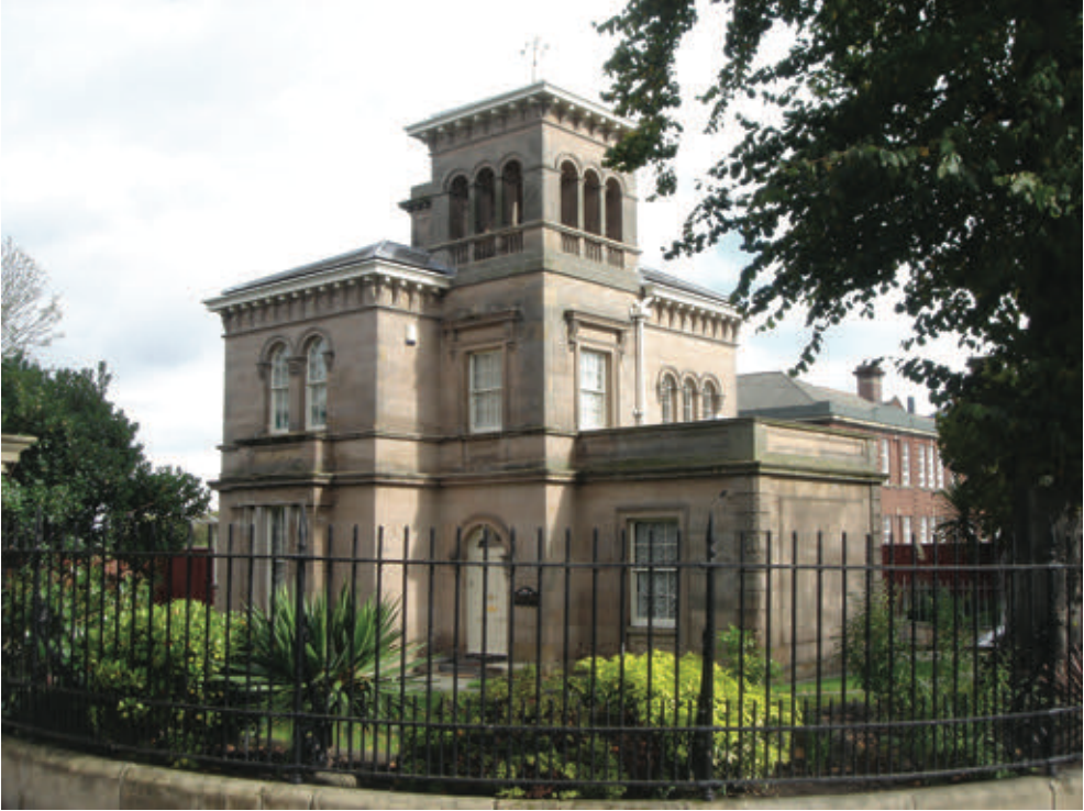
Figure 1. Italian Lodge in Birkenhead Park.