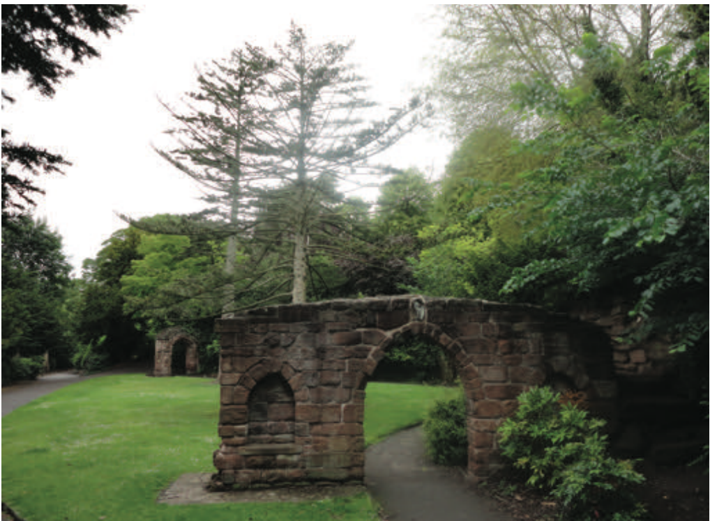
Figure 6. Medieval arches in Grosvenor Park, Chester. Photo: author, 2010

This is especially evident in the designs for buildings within the park by Chester architect John Douglas (1830–1911), but also the incorporation of other features and ways in which prospects were contrived. The main entrance lodge, for instance, was designed in timbered style intended to be ‘in accordance with the ancient character of the City of Chester’ with oak carvings of the earls of Chester and William the Conqueror, was replete with historical resonances that demarcated the park as a special place while underscoring its links with the ancient city. 42 Similarly, gothic archways were removed from local churches and other sources and placed within the park (Figure 6), while Roman antiquities were also uncovered during landscaping and planting between 1865 and 1867. Designed by Kemp and laid out by Robert Reid, the park commanded views of ‘Beeston Castle, the Ridley and Peckforton Hills, and the charming landscape of the meadows’.