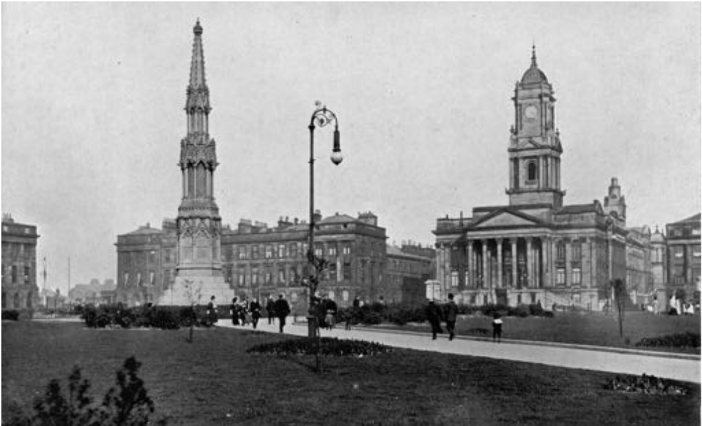
Figure 2. Hamilton Square in Birkenhead, c.1905; from Fine Art Views of Liverpool, Birkenhead and New Brighton (Liverpool: Philip, Son & Nephew, c.1910)

so it became an attractive place to settle and an embodiment of the kind of improving, municipal, laissez faire, Liberal political philosophy advocated by Paxton (Figure 2). 10