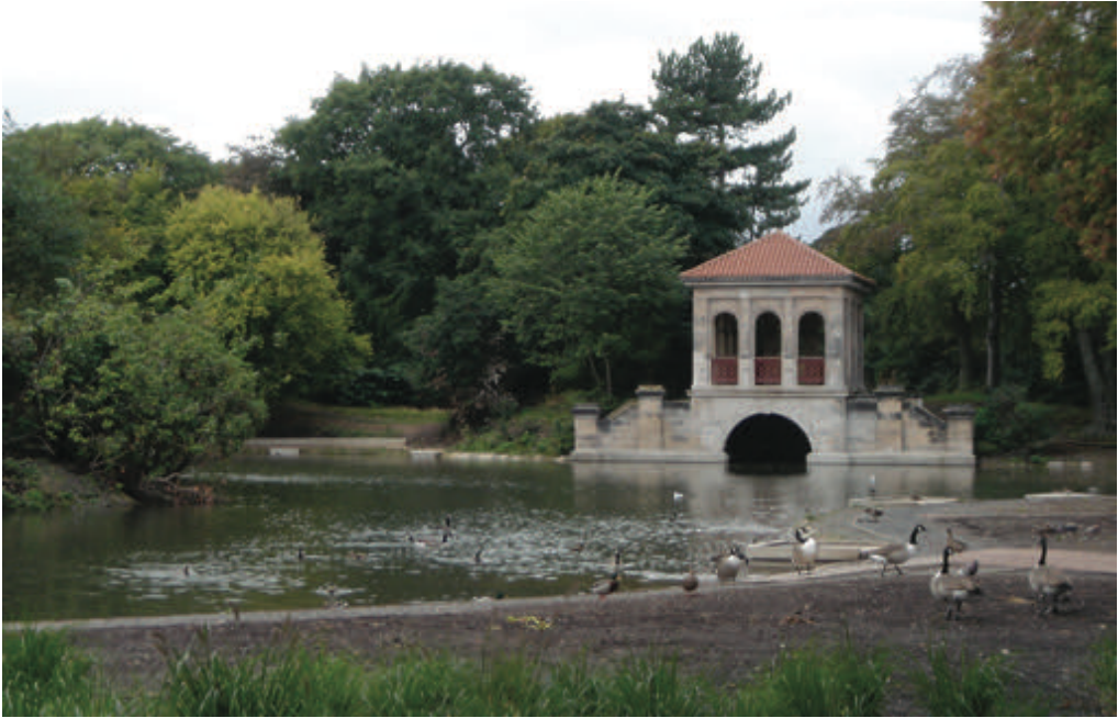
Figure 3. Lake and boathouse in Birkenhead Park.

was pleased to see that park ‘privileges’ were being enjoyed ‘about equally by all classes’, including many ‘of the common rank’, women and children and those ‘suffering from ill health’. Like Bagshaw and the Nottingham park promoters, Olmsted was impressed at how mere ‘worthless wastes’ had become a place ‘of priceless value’ with the sounds of ‘bleating goats and braying of asses’ being replaced by the ‘hasty click and clatter of many hundred busy trowels and hammers’ and ‘thronged streets of stately edifices’. Birkenhead encapsulated the ‘advanced science, taste’ and ‘enterprising spirit’ of ‘profitable commerce’ at its best and was a ‘model town [...] not only to philanthropists and men of taste, but [also] to speculators and men of business’. It was therefore not surprising that so many of Olmsted’s subsequent park designs featured ‘masses of shrubs with winding paths on steep ground’, planting on slopes with lawns and a mixture of ‘the picturesque and pastoral landscape styles’, nor that Kemp’s book, which was largely written at Birkenhead and encapsulated the methods that created it and suburban improving ethos so well, should have been one of his favourite landscape gardening works. 14