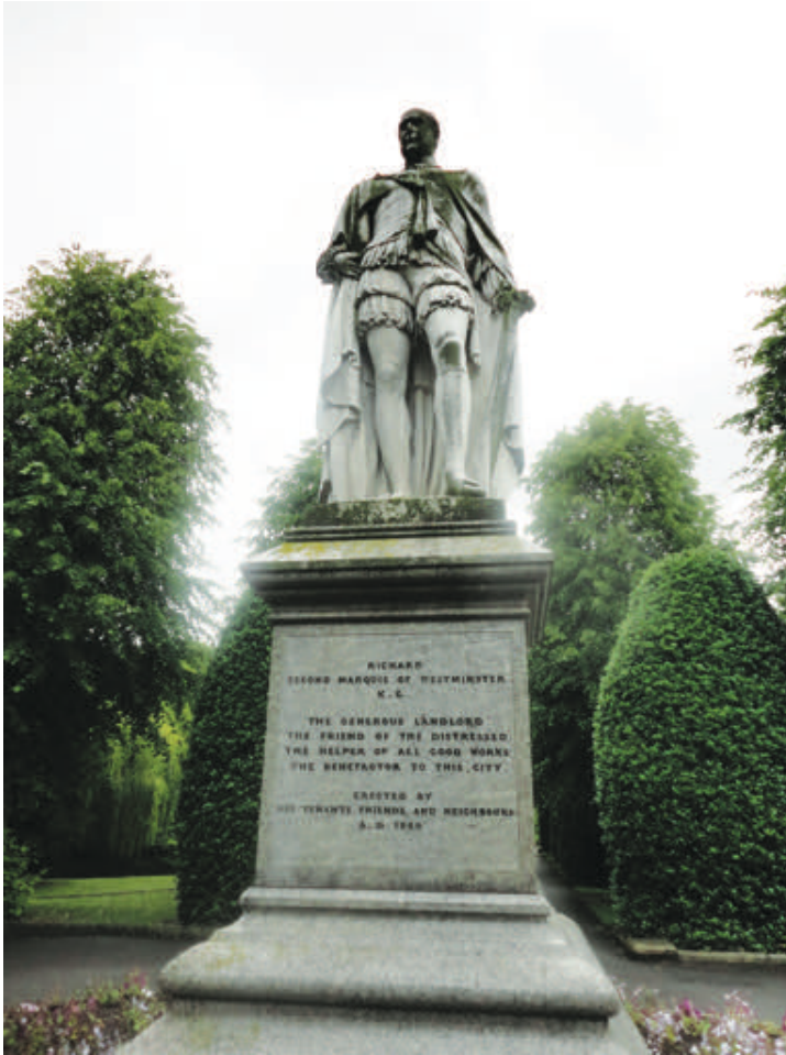
Figure 7. Statue of Richard, 2nd Marquis of Westminster, in Grosvenor Park, Chester.

There were two main more formal fifteen-foot-wide avenues intersecting at right angles, where a statue of the ‘princely’ donor was placed in 1869 (Figure 7), and the one from the lodge southward was planted with ‘handsome specimens’ of Lawson cypress, Nootka or yellow cypress and golden or Chinese juniper in alternate pairs, which were easy to manage and would ‘not interfere with the view of the statue from Foregate-street and the entrance lodge’. The crossing east–west avenue, which terminated in the ‘fine old Church of St Johns’ with its evocative ruins, was planted with pyramidal broad-leaved hollies intended to ‘throw out the statue in bold relief’ and again keep the view of it ‘perfectly uninterrupted’. The comparatively informal, rustic ‘belts or clumps’ surrounding the park were ‘furnished with a great variety of ornamental and flowering trees and shrubs, evergreens and rhododendrons’. More evergreens were planted among rocks along walks with fine views sloping down towards the River Dee, while Billy Hobby’s Well at the bottom of the hill with its historical associations (and accretions) was covered with a new polished red granite cover with medieval-style capitals designed by Douglas and incorporated into the park while also serving a practical function as pump-house pavilion for the water gardens. 43