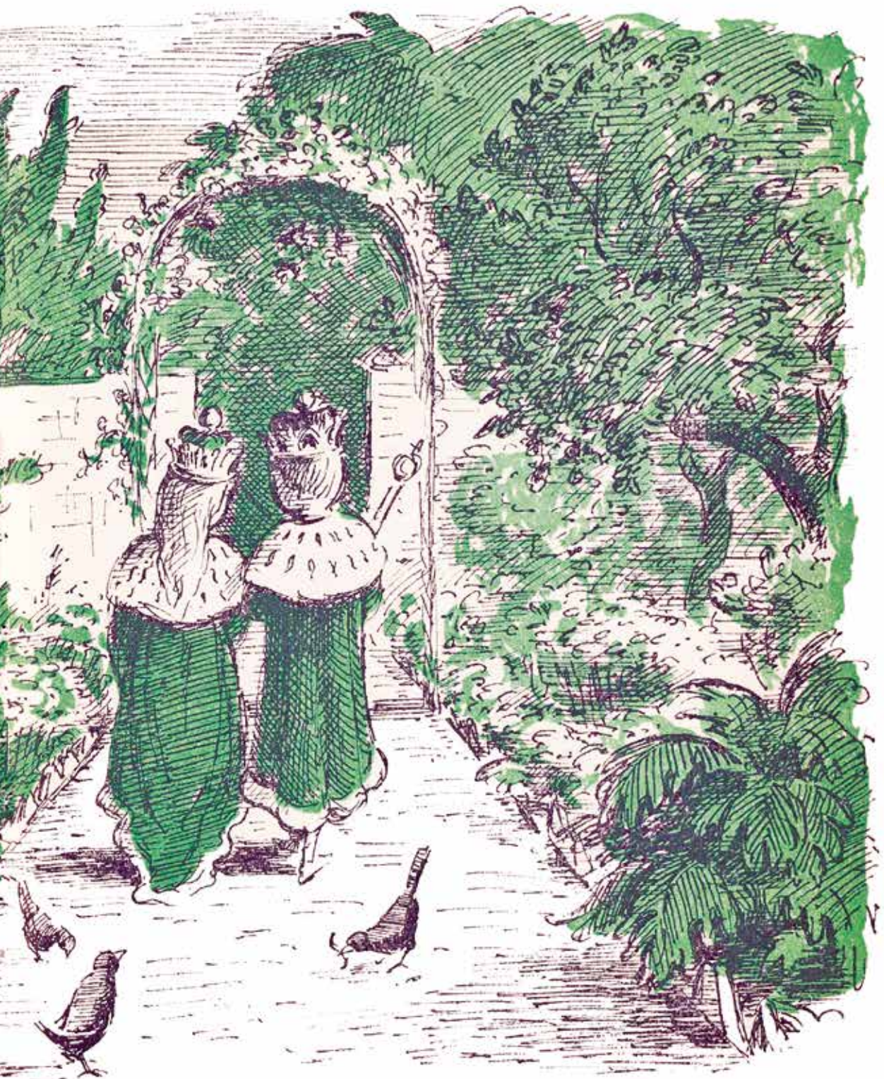
with thanks, and apologies, to Robert Graves and Edward Ardizzone 'Henry and Mary' from The Penny Fiddle , 1960