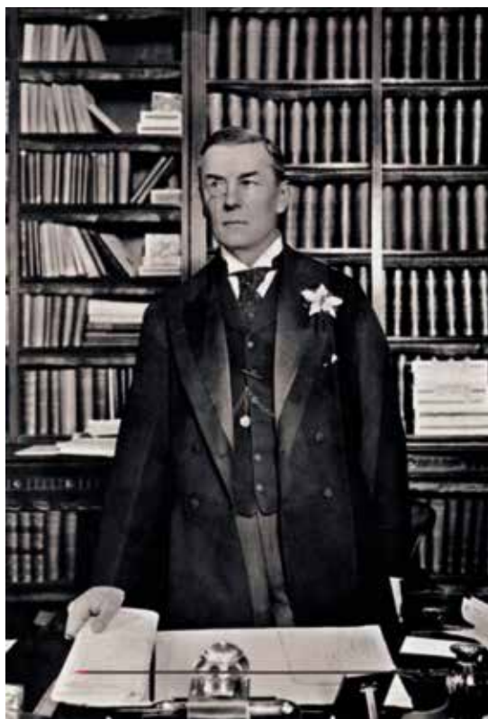
Joseph Chamberlain in his study at Highbury, with orchid boutonhole; he even took them, on ice, on a voyage to South Africa following the Boer War

Highbury Hall and the University's Winterbourne House and Garden both of which we will be visiting as part of the weekend.