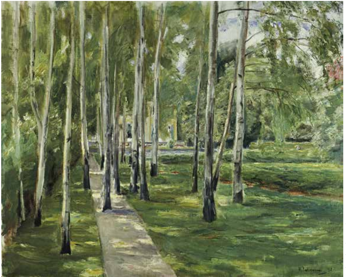
Der Garten des Künstlers , Max Liebermann 1918, shows his unusual planting of trees in pathways. I have seen this at the Tiergarten, Berlin, where it works as bike calming! Is this where the idea came from?

As usual the presentations will be followed by a chance to ask questions, an often surprising and informative part of the proceedings. Presentations will not necessarily be given in this order... Followed at 1pm by a hot buffet lunch .