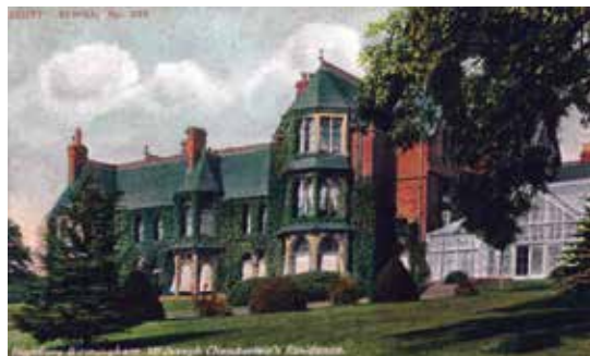
This postcard view barely hints at the range of show glass houses Chamberlain developed to hold his orchids and other exotics at Highbury

Awaiting news of its restoration bid with the Lottery, plans are afoot for a major restoration of the house and gardens to restore them to full use by the people of Birmingham and beyond. Joseph Chamberlain was a politician and gardener with a love of orchids (he was rarely seen without an orchid in his button-hole) and rhododendrons. Originally laid out by, and very much typical of, a design by Edward Milner, Joe later developed a taste for the historic revivalism in garden fashion