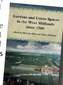
GT news / Summer 2018