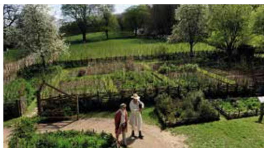
Weald and Down Museum

Another one day 'taster' interactive course to explore