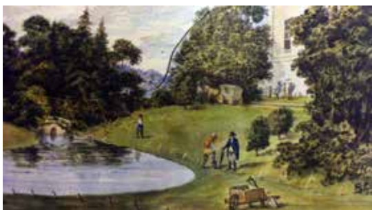
A rare image of Repton laying out a lake edge, with a very optimistic gardener and spade!

a very significant figure, both theoretically and socially, in his own right.