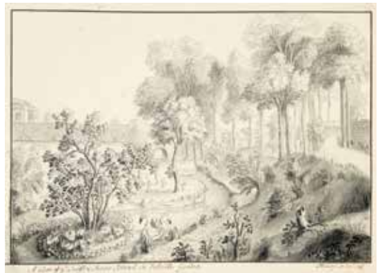
National Gallery of Ireland

From then on readership grew quite quickly. 25,000 hits in 2015 became nearly 38,000 in 2016 and 46,000 last year. Its still growing fast, with just over 40,000 hits so far this year. I'm obviously hoping that renaming the blog and moving it to the Gardens Trust will keep the momentum going.