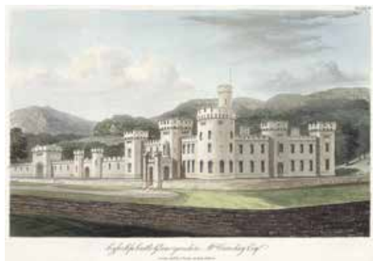
Merthyr Tydfil Museum

Save the dates in May 2019 for the WHGT's weekend conference which aims to highlight Industrialists' Landscapes in South Wales.