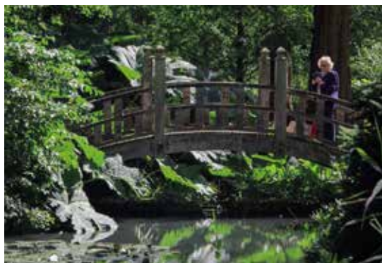
The Japanese Bridge, Winterbourne