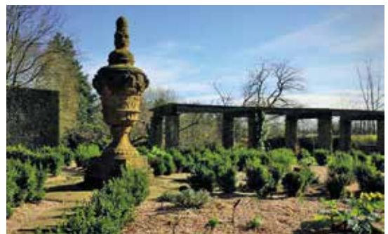
The Herb Circle, Winterbourne