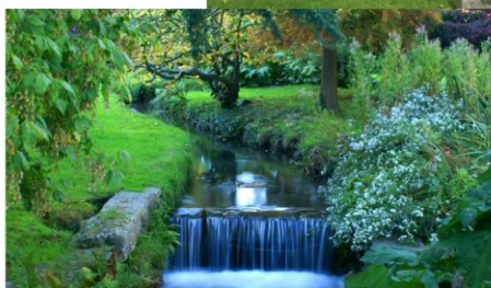
Historic Landscape Project

Devon GT has supported Plymouth City Council in its excellent rejuvenation of Freedom Fields and Devonport Park. HLF have given PCC many millions of pounds and both parks are looking fantastic. Devonport Park in top photo.