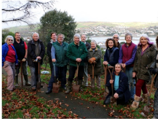
Historic Landscape Project

Devon GT worked with the Friends of Homeyards Botanical Garden on a successful HLF bid to restore the gardens