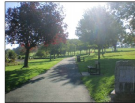
Jacksons Recreation Ground and Fort Pitt Gardens, Chatham

The Kent Compendium of Historic Parks and Gardens for Medway