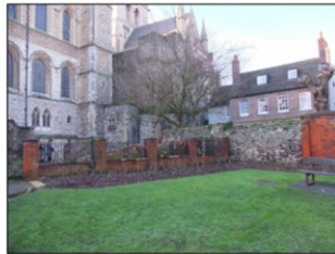
War Memorial Gardens, Rochester

The Kent Compendium of Historic Parks and Gardens for Medway