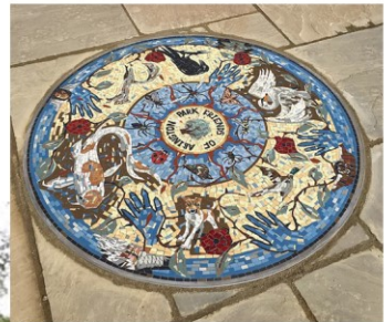
Historic Landscape Project

Whenever possible, try to support the formation of new Friends groups through your projects.