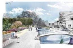
Historic Landscape Project

The Jellicoe Water Gardens was neglected and decaying in 2011 when GHS and Kate Harwood put on a Study Day at Hemel.