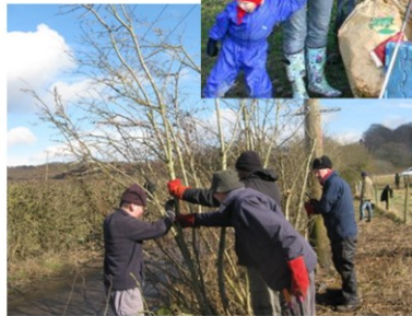
Historic Landscape Project

Friends Groups are becoming crucial for the successful management of parks and in securing additional funding (an average of £35k per year)