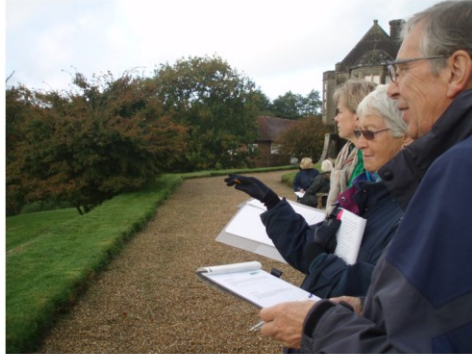
Historic Landscape Project

Research work = one of CGTs' vital strengths Key to understanding significance , which is crucial in conservation