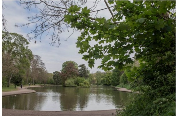
Historic Landscape Project