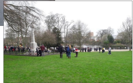
Historic Landscape Project

The more people get to know a park, the more they will care what happens to it.