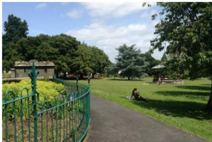
Historic Landscape Project