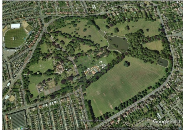
Historic Landscape Project

Collaborative project between the East Mids CGTs (Nthants, Lincolnshire, Notts, hopefully also Leics & Rutland, Derbyshire). HLF 'Our Heritage' application.