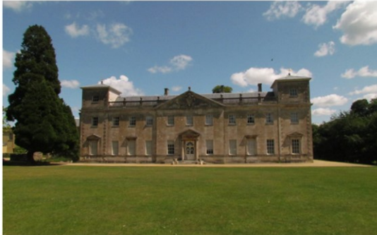
Historic Landscape Project

London PGT: 'Save Victoria Tower Gardens'; GT, Wiltshire GT & Friends of Lydiard Park → withdrawal of development plans