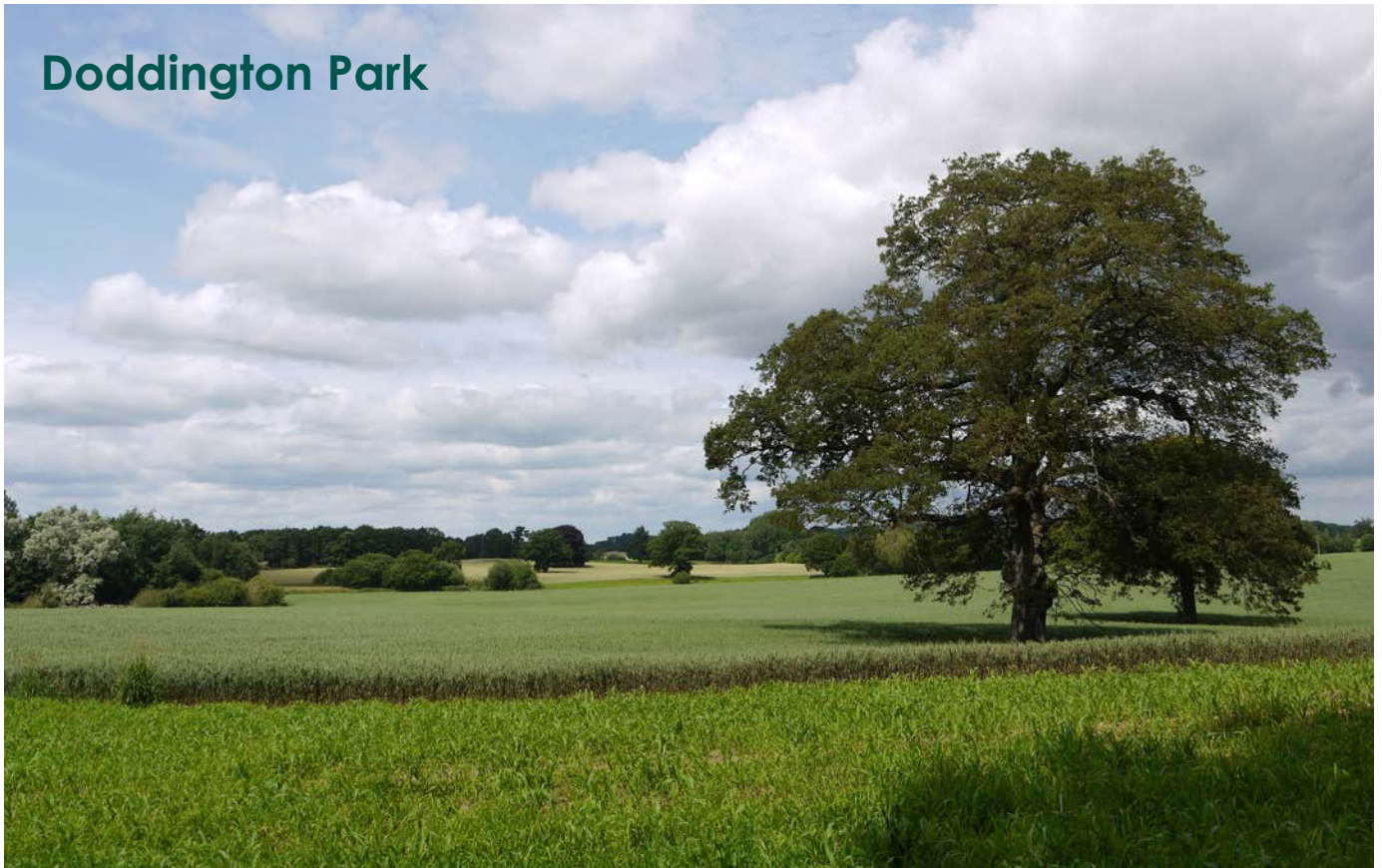
Doddington Park (East Cheshire, IL)