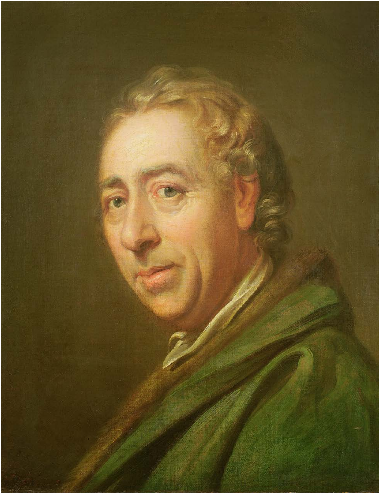
Portrait of Lancelot 'Capability' Brown, c. 1770-75, Cosway, Richard (1742-1821)

Cover image: aerial photograph of Moor Park, Hertfordshire, showing the impact of golf courses and parking on the Brown landscape.