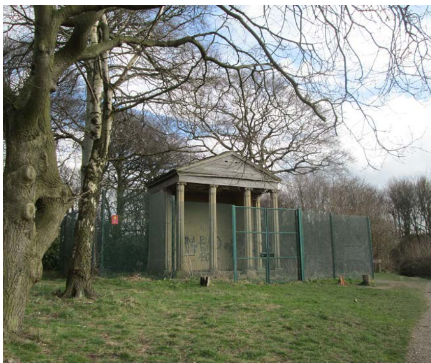
The derelict temple in the public park at Temple Newsam (Yorkshire, II)

Rear cover image: aerial photograph of Aynhoe Park (Northamptonshire, Grade II) Development is proposed in the foreground and large swathes of parkland have been converted to arable with the loss of many important trees