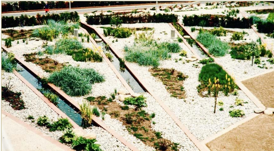
Hounslow Civic Centre by Preben Jakobsen 1977.