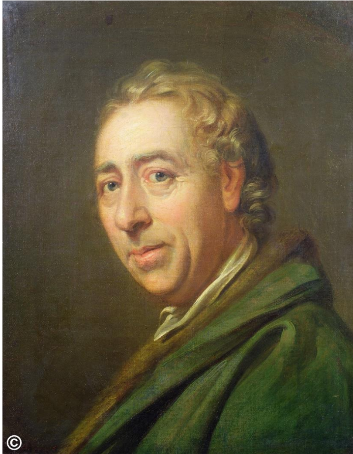
© Portrait of Lancelot 'Capability' Brown, c.1770-75, Cosway, Richard (1742-1821)/.