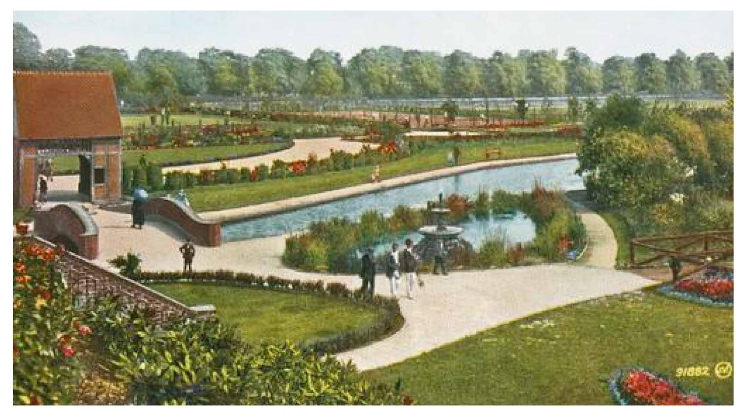
Fig 8. Rowntree Park, York, Opened in 1921, an example of a memorial park, gifted to the City of York by the Rowntree family in memory of members of the York Cocoa Works