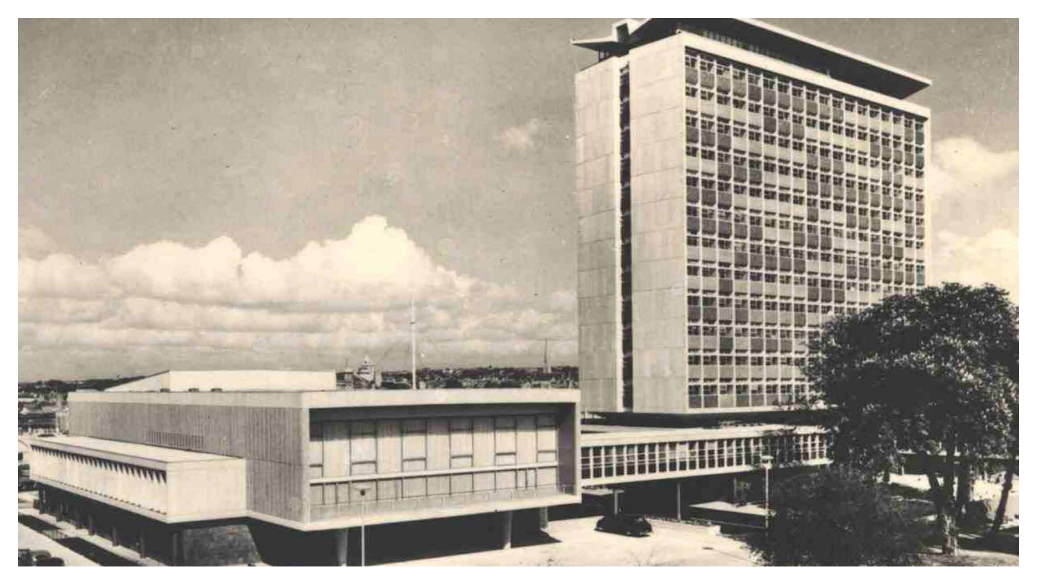
Fig II. Plymouth's Grade-II registered Civic Square (originally named the Great Square) was designed by Geoffrey Jellicoe as part of the city's post-war civic reconstruction and