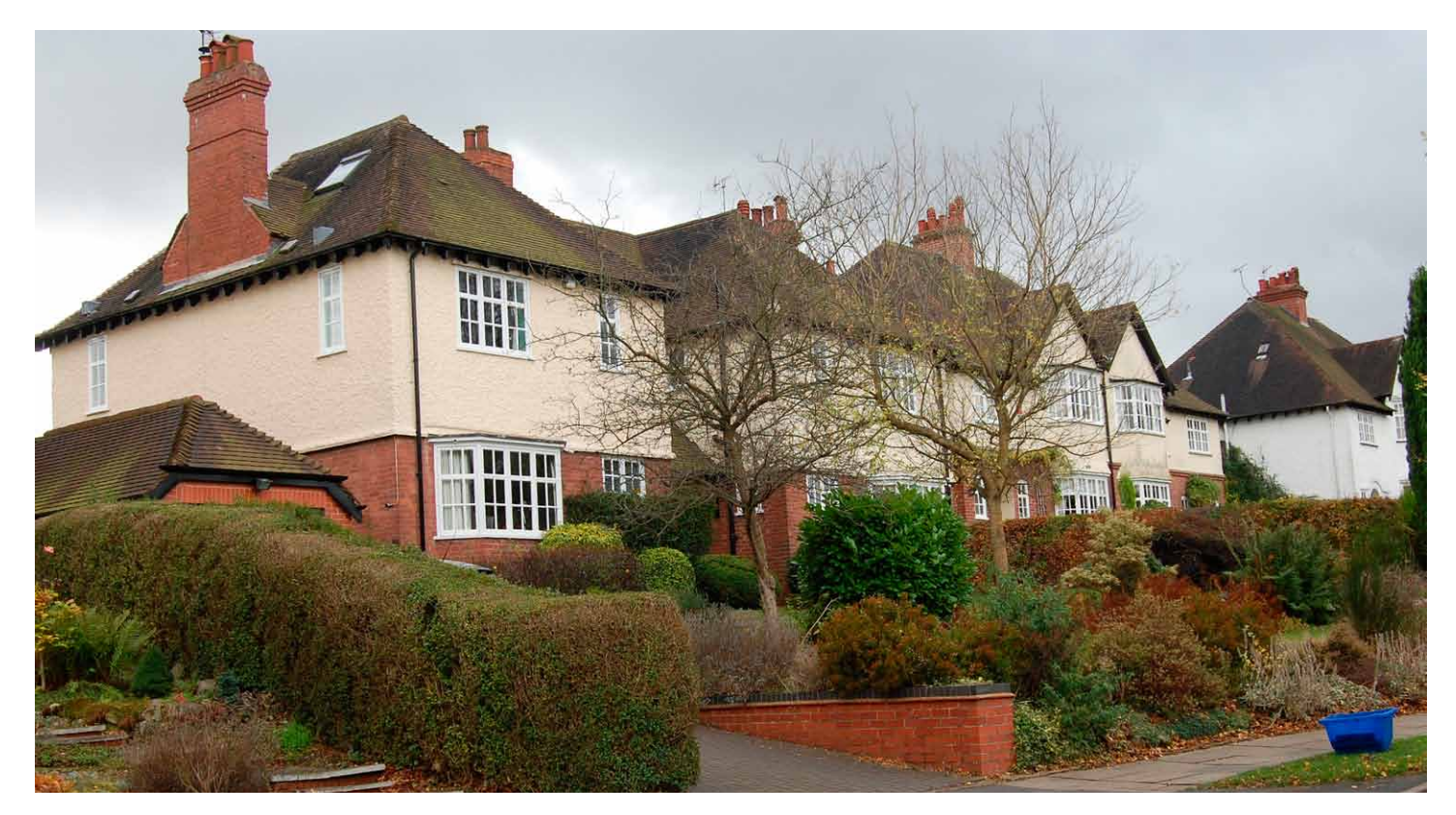
Fig 9. Moorpool, Harborne, Birmingham. A private housing estate of 1908-13, in which gardens and public green spaces were, and are, important. Registration is generally