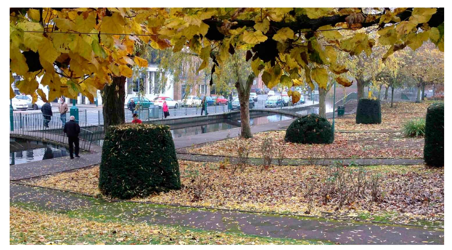
Fig 12, Hemel Hempstead was one of the post-war New Towns, Geoffrey Jellicoe's Master Plan envisioned 'a city in a park'. A key component of the city centre was (and is)