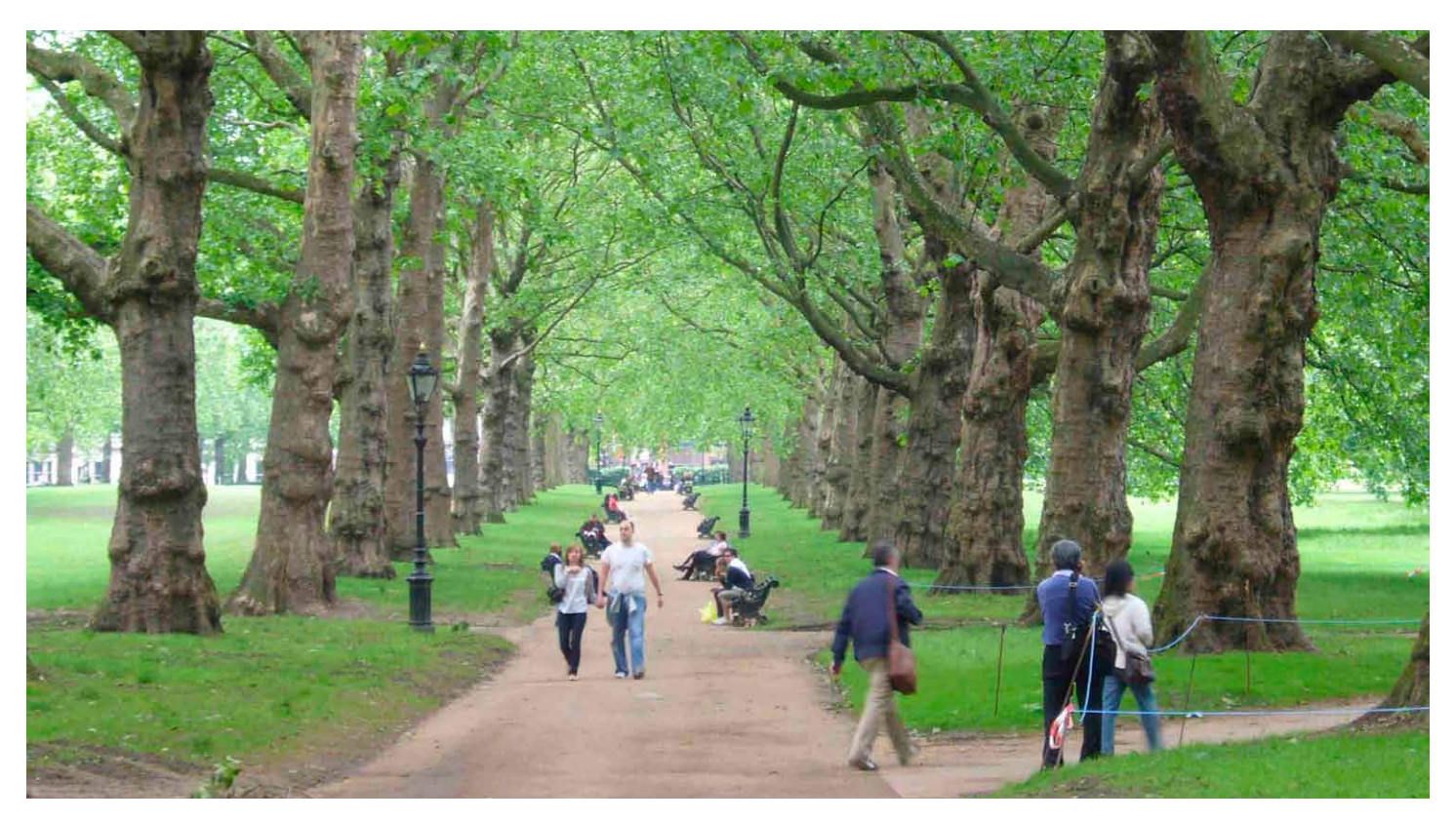
Fig 2. Green Park, London. Until the Restoration of the monarchy in 1660 this was open waste or meadowland. King Charles II enclosed the ground with a high brick wall to form