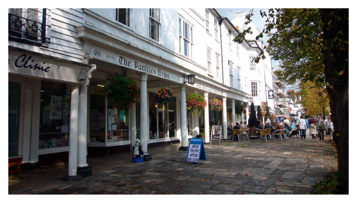
Fig 1. The Pantiles, Tunbridge Wells, Kent. A grass walk between a double row of trees was laid out as early as 1638. Here the company walked in intervals between taking the waters.