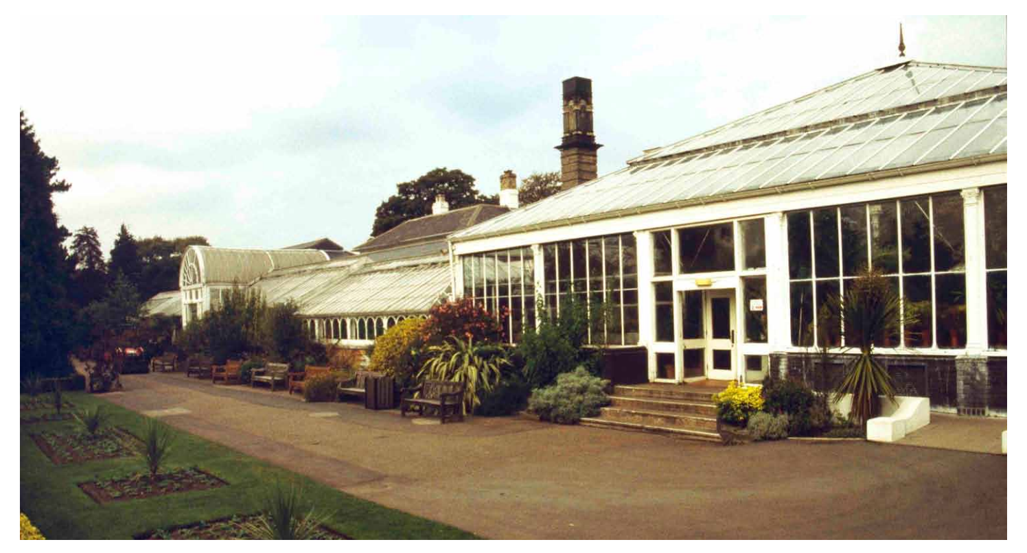
Fig 4. Birmingham Botanic Garden (registered Grade II*) opened in 1832. The general plan, by J.C. Loudon, did much to disseminate his ideas on gardenesque layouts and plantings in the Birmingham area. The range of glasshouses includes (nearest the camera)