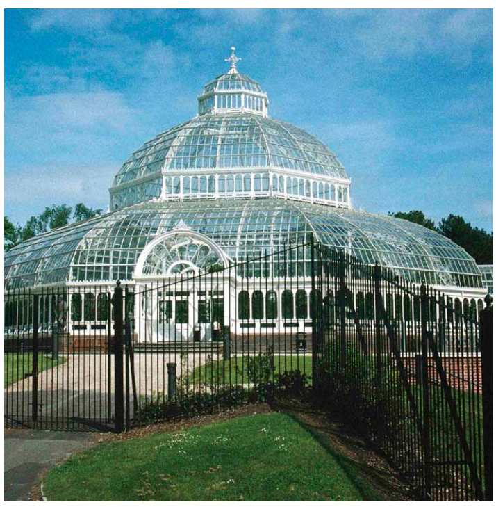
Fig 6. The Palm House (listed Grade II*) in Liverpool's Sefton Park (registered Grade II*), opened in 1872. Although the most prestigious of the city's 'ribbon of parks', its completion was protracted, and plans for a botanic garden were abandoned. The mound on which the conservatory of 1896 stands (accompanied by six statues of worthies) was originally intended for a bandstand.

visible; and that views should look inwards from the perimeter carriageways – ambitions only possible in the larger parks.