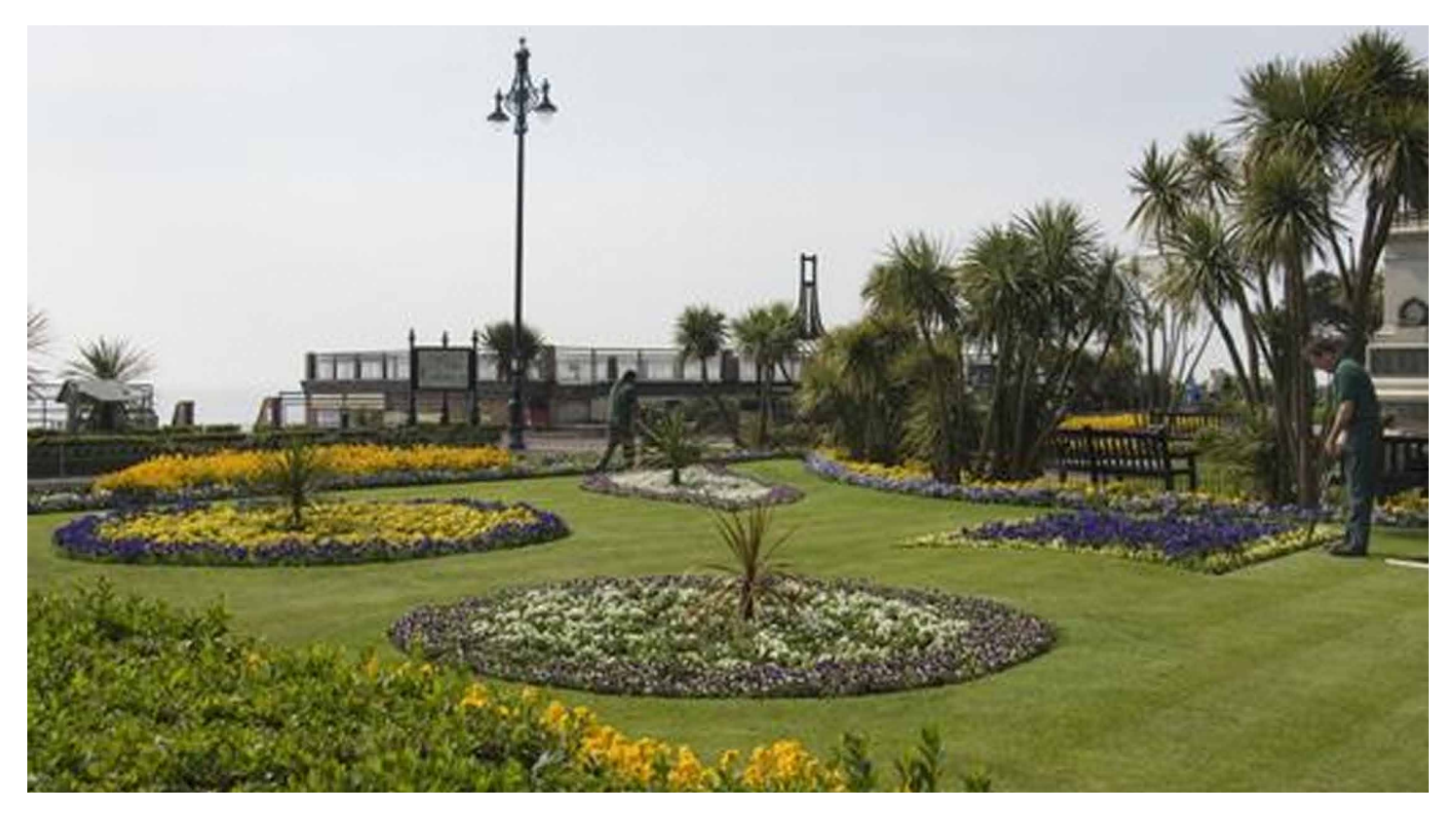
Fig 10. Clacton developed as a resort in the mid nineteenth century, and pleasure grounds and cliff-top gardens were laid out in the 1870s. In 1921 the council spent 'considerable