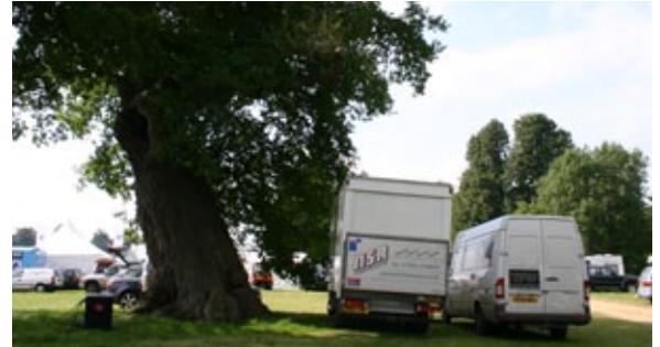
Do not allow vehicles to compact soils and damage roots.