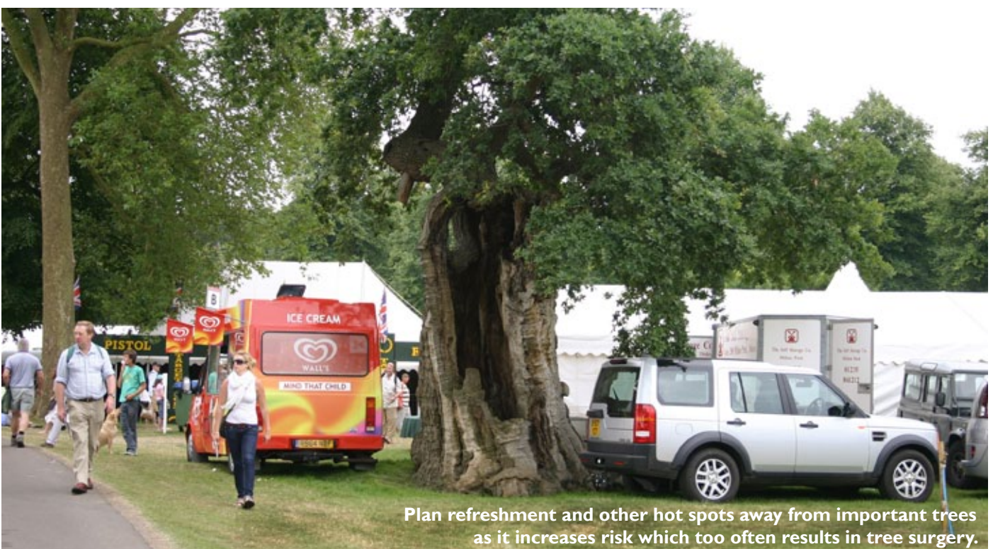
Plan refreshment and other hot spots away from important trees as it increases risk which too often results in tree surgery.