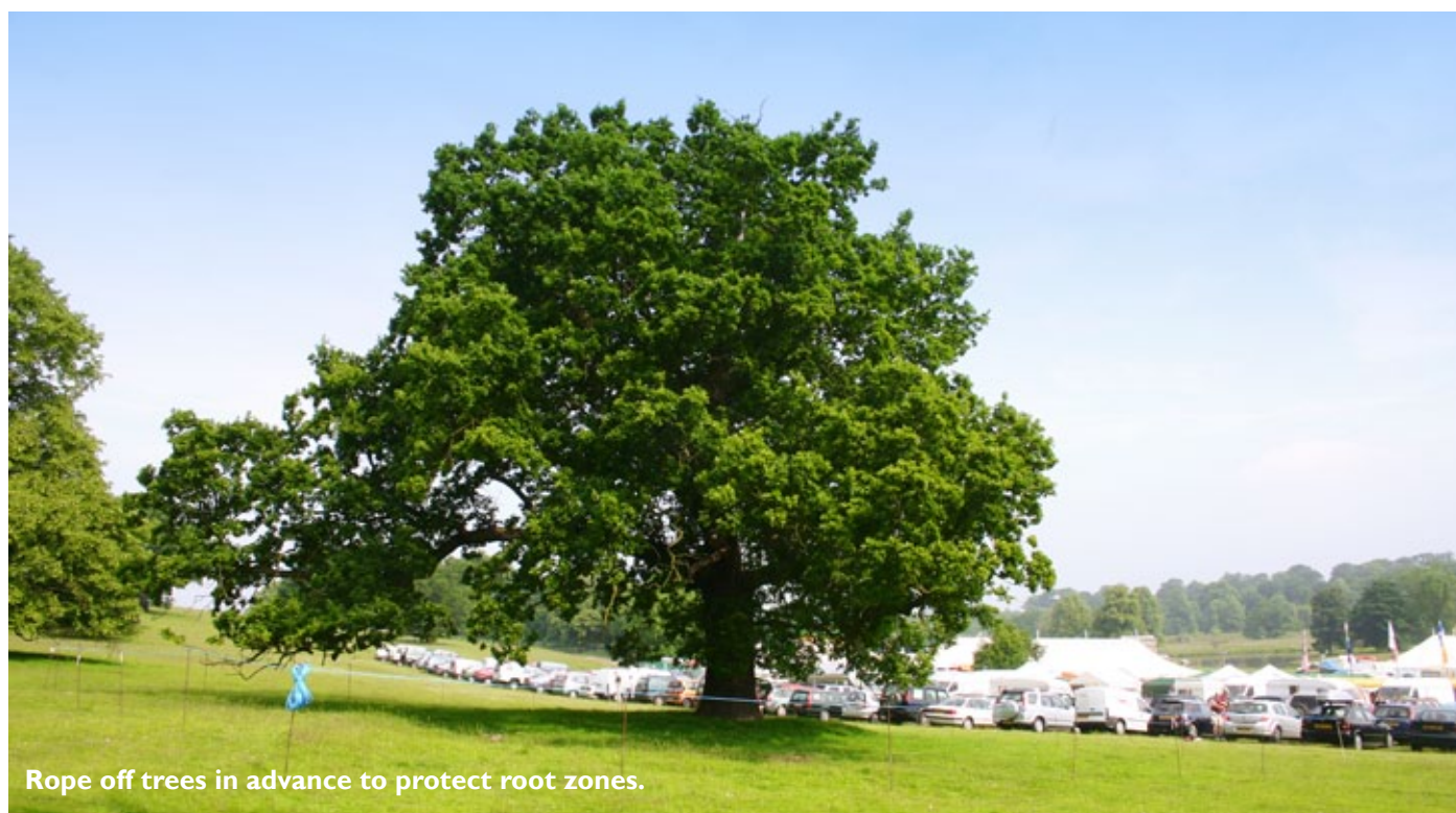
Rope off trees in advance to protect root zones.