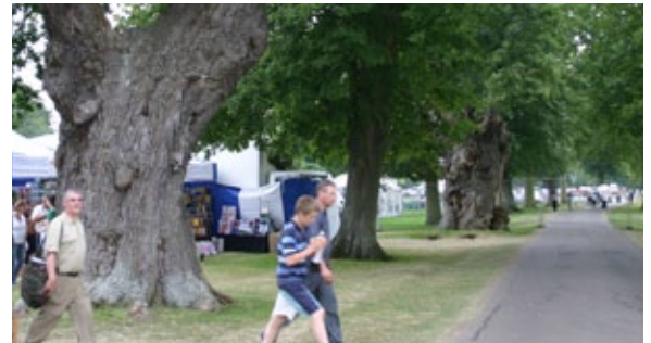
Trees provide a special setting for major events however even footfall can cause compaction and seriously affect tree roots.