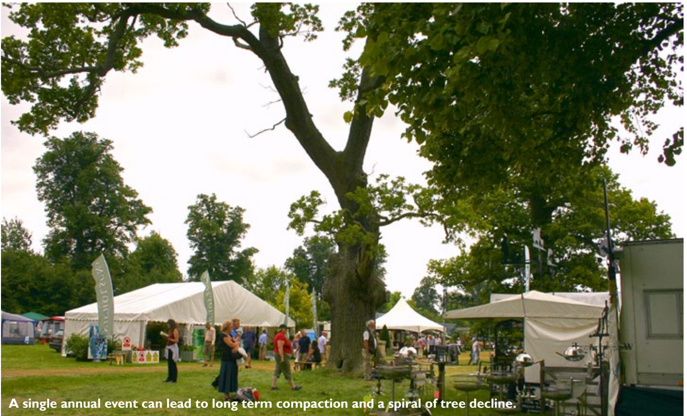
A single annual event can lead to long term compaction and a spiral of tree decline.

Ancient trees are a remarkable legacy, adding to the uniqueness of the British landscape and give us great insight into our cultural history, as well as host to exceptional biodiversity that is not found on younger trees.