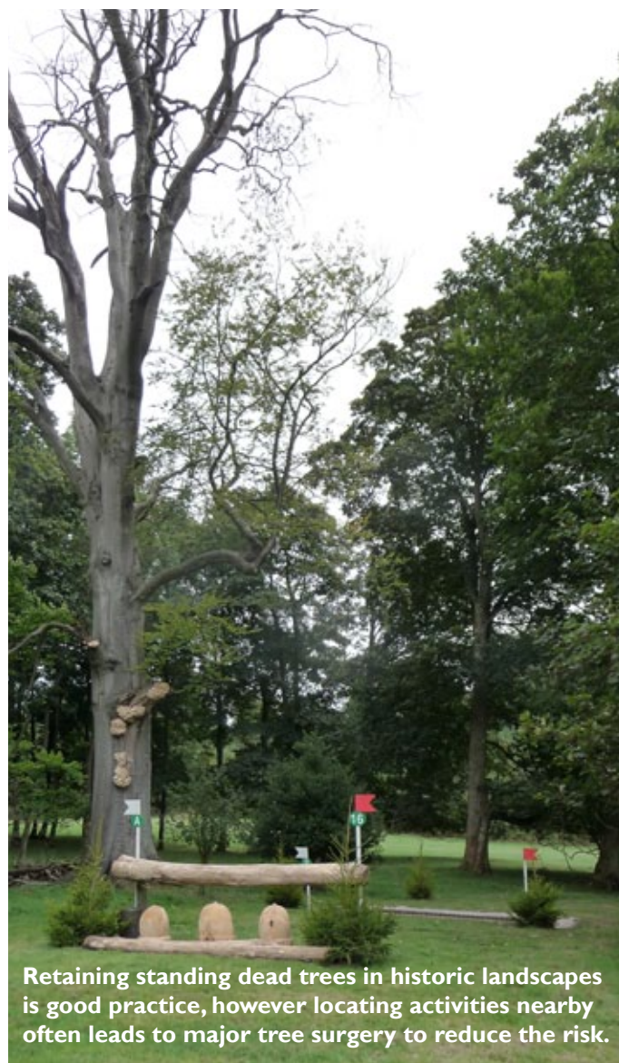
Retaining standing dead trees in historic landscapes is good practice, however locating activities nearby often leads to major tree surgery to reduce the risk.

This guidance is for tree owners, event organisers, specialists designing facilities, heritage and other land management advisors and local planning authorities. It is vital that all stakeholders work together to avoid damage and the impacts of participants, visitors, structures and the construction process.