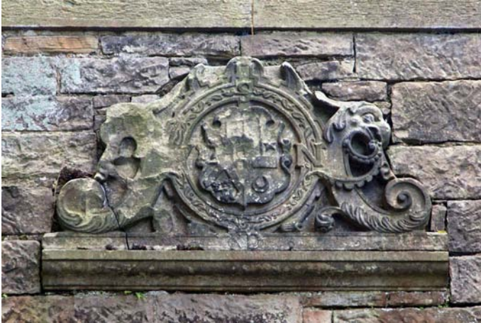
Figure 2. Sculptured stones set into the great retaining wall of Dean Cemetery, 1845–46.