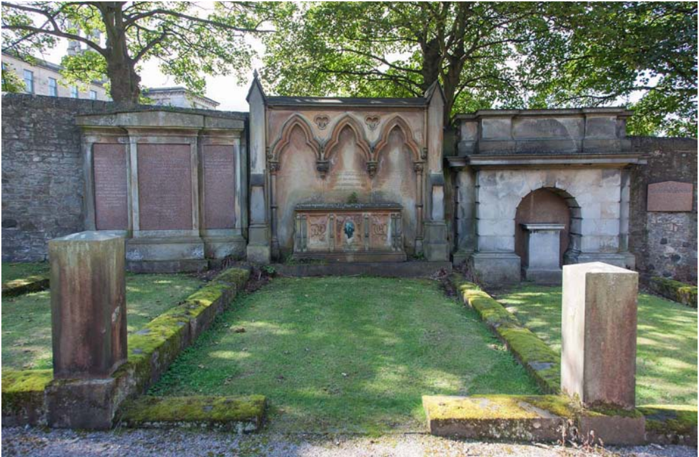
Figure 8. The Celebrated West Wall with the tomb of Henry, Lord Cockburn.