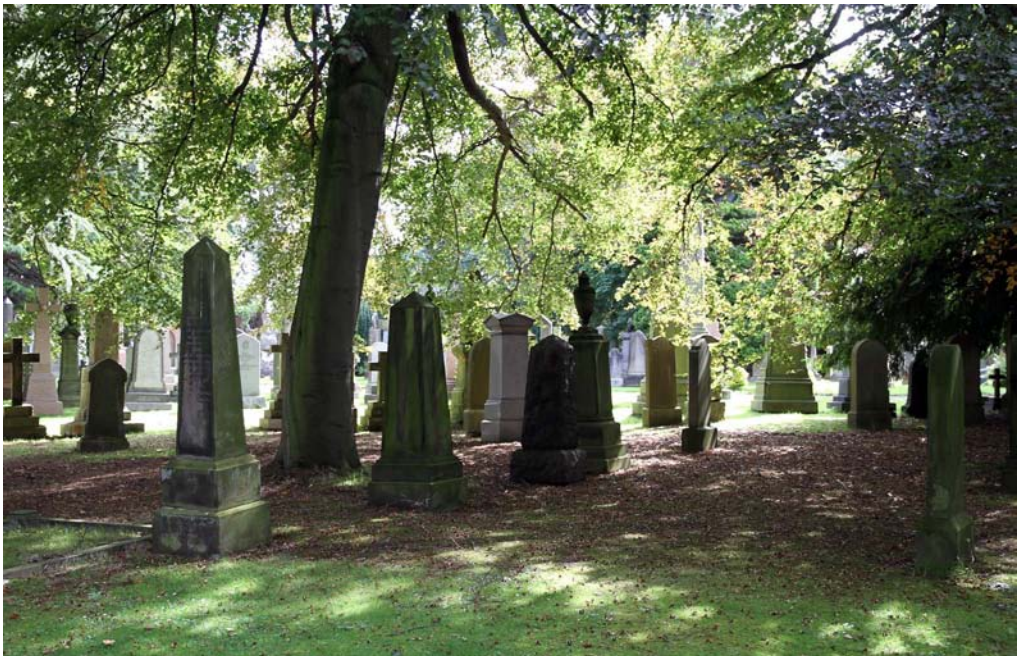
Figure 6. Lachrymose trees envelope graves and monuments severing the relationship between the tombs and the dead and the heavens. Photo: author, 2014

So, during the 1840s–60s, the character of Dean Cemetery was quite different to the one with which we have become familiar. There was a wooded setting borrowed from the valley of the Water of Leith and Dean Hospital and a stately beech avenue, but otherwise the relationship between the dead, their monuments, the sky and the heavens would have been much stronger and the planting would have been at a much lower level. Donald Rodger also noted that as recently as the 1970s the trees were pollarded to keep the crowns low and compact. Meantime, the needs of the living were catered for in the colourful plantings and picturesque walks down to the Water