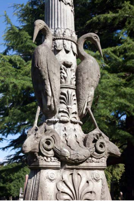
Figure 7. Dean Cemetery sculptured tomb. Photo: Nick Haynes, 2014

The cemetery gardener, for all his experience, would appear to have been unfamiliar with the opinion of Loudon who advocated needled conifers for a cemetery and dark evergreens like yew that do not drop their leaves and make a mess that requires clearing