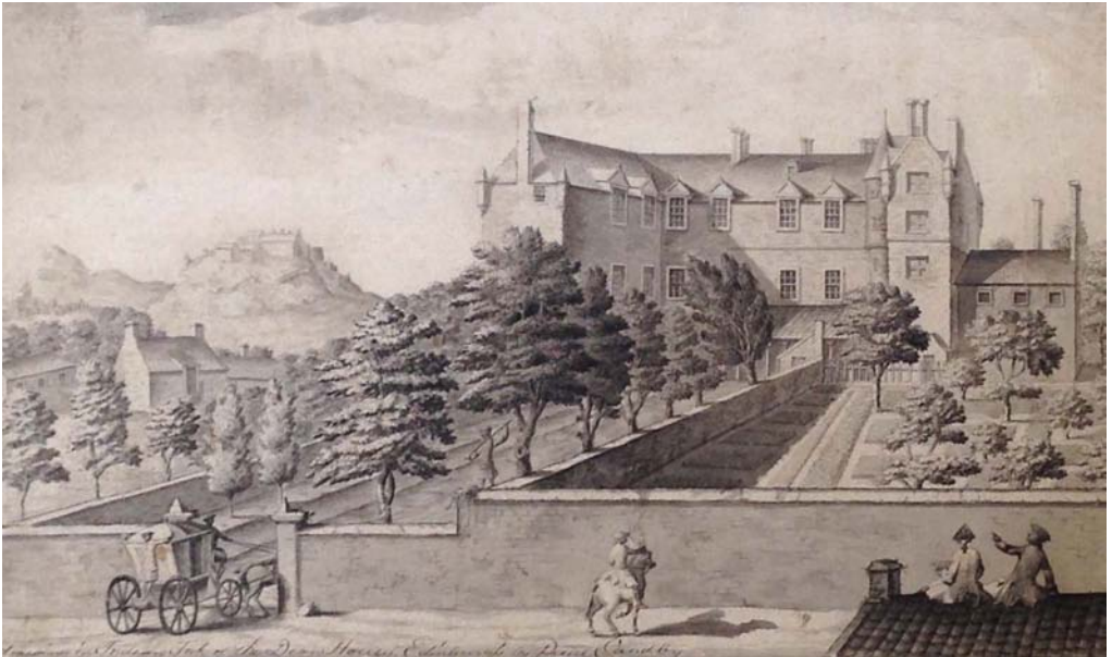
Figure 3. Paul Sandby, The Dean House, Edinburgh (date unknown, but before 1752)

From the mid-eighteenth century the Nisbet family resided mostly in America and Dean House was let to notable Edinburgh families. Lord Swinton was a tenant until his death in 1799, and through his family and legal connections with the Swintons, Henry Lord Cockburn was a frequent visitor there. Cockburn's journal entries provide descriptions of Dean House and gardens at the end of the eighteenth century: