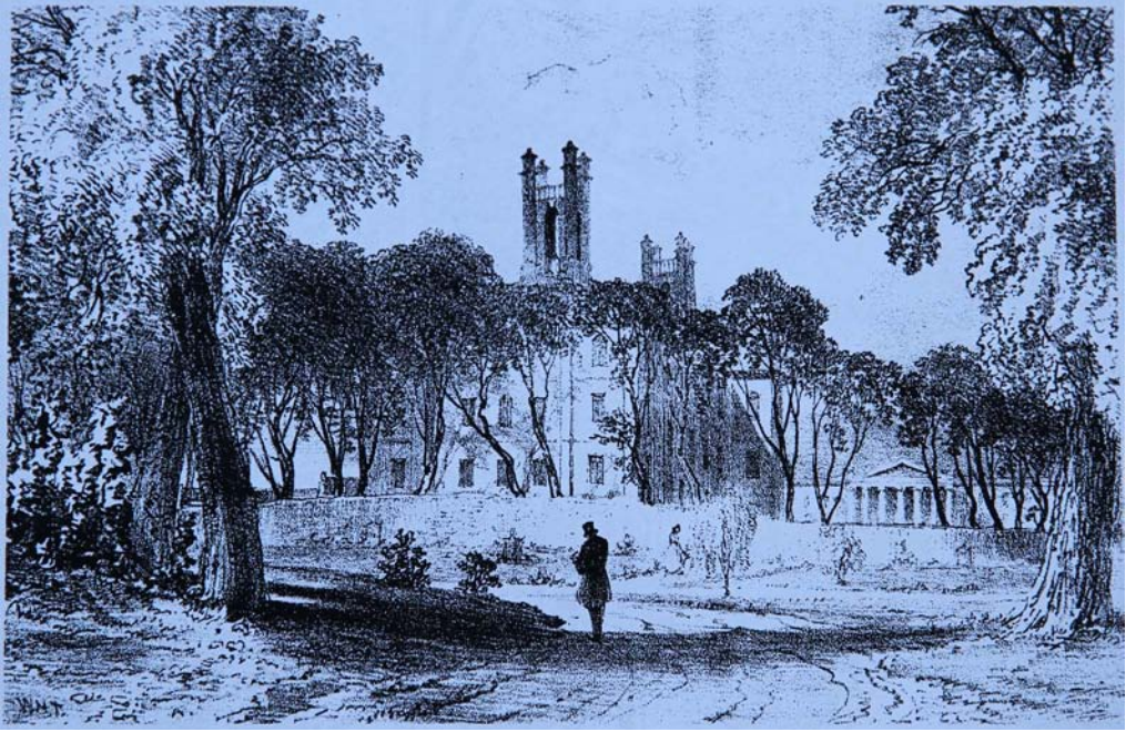
Figure 5. Plate from the Edinburgh Western Cemetery Company 1846 prospectus; Edinburgh Scottish Collection, City Library

the Old Dean is now a grass plot. I looked in the other day – the gateway, bell and all as it was. The beech avenue and holly hedges are there; but instead of terminating in the tall pile of masonry it opens in a flat turf, soon to be full of graves. 18