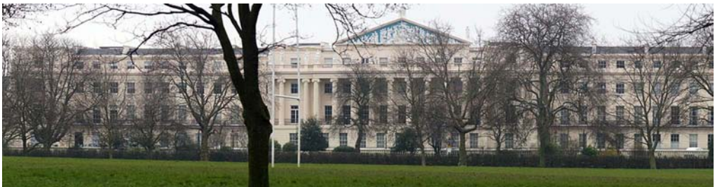
Figure 6. Cumberland Terrace is now almost invisible from the Outer Circle and the interior of the park, and is therefore disconnected from the landscape it was intended to ornament.