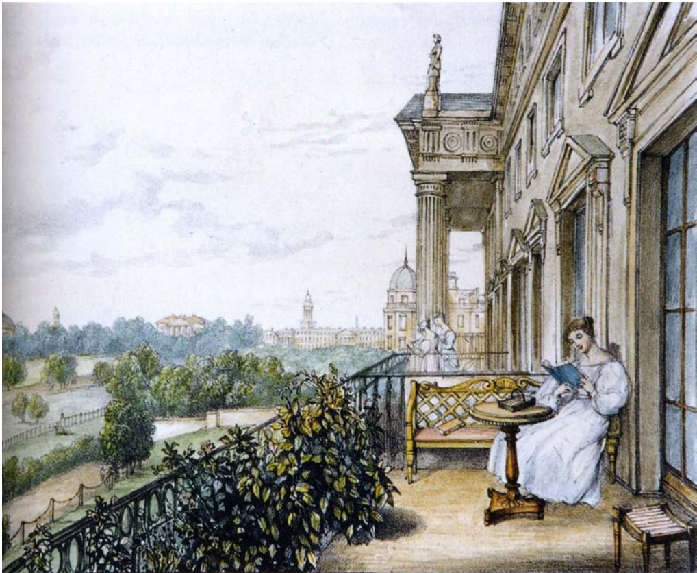
Figure 2. One of two prints after sketches by Miss Rogers from c.1835 that supplies early panoramic views over Regent's Park. The Outer Circle – visible in the middle ground – was laid out between 1811 and 1812 and was in John Nash's view fundamental to establishing unity between landscape and architecture.

The provision of roads and public footpaths was central to the park's layout and success. The most important of these was the Ring or Outer Drive, now known as the Outer Circle. Staked out and planted to Nash's plans between 1811 and 1812, the two-mile-long 'fine broad gravel road' was among the park's first features. 5 It was the mediating physical link between the central open space and the encompassing terraces and their ornamental gardens. The author of A Picturesque Guide to the Regent's Park (1829) draws attention to the role of the drive and picks out particular designed views to be enjoyed from it: 'through the whole place there is a winding road which commands at every turn some fresh features of an extensive country prospect'. 6 The road was closed at ten in the evening, except to residents, but during the day it formed a public promenade. In Reptonian terms it led the viewer, whether in a carriage, on horseback or on foot, through an unfolding sequence of designed landscape scenes or pictures. As nineteenth-century imagery makes clear, the pedestrians and traffic on the circuit drive were both consumers of and also constituents in the picturesque scenery. For instance, an anonymous engraving of Cumberland Terrace of 1837 illustrates what William Gilpin referred to as the picturesque quality of disorder as accentuated by contrasting order: