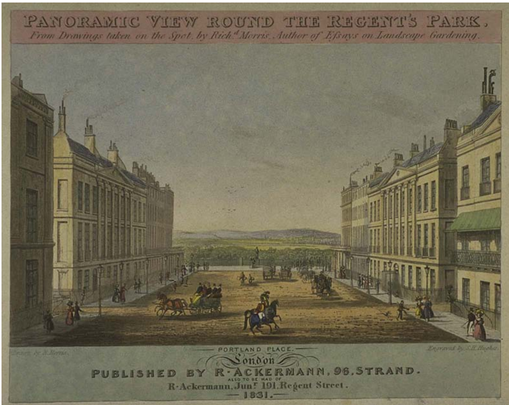
Figure 3. Looking north from Portland Place to Regent's Park and Primrose Hill. Park Crescent and Park Square funnelled the countryside into the town and formed a capacious entrance to the park.