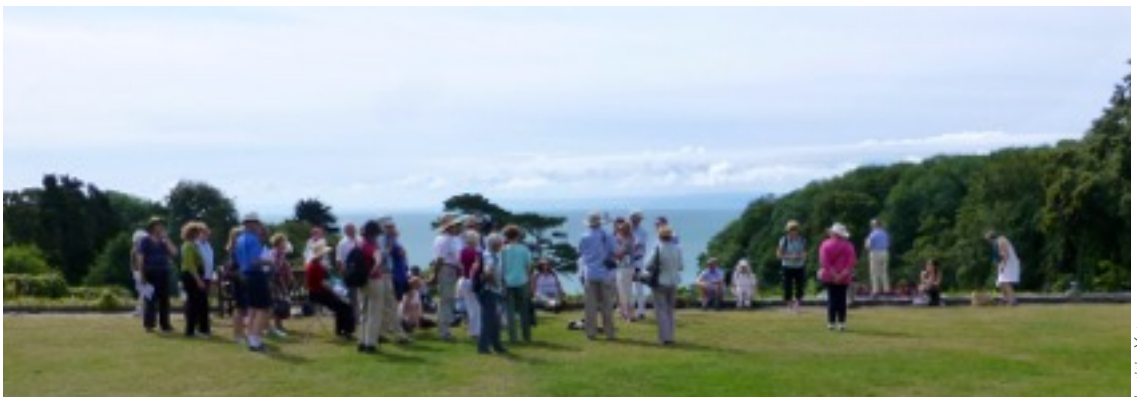
Robert Peel, with megaphone in hand, attempts to bring GHS members to order at St Donat's Castle

Otherwise much of the Society's time and energy is taken up in preparing for the proposed merger with the AGT. The name agreed for the new organisation is The Gardens Trust .