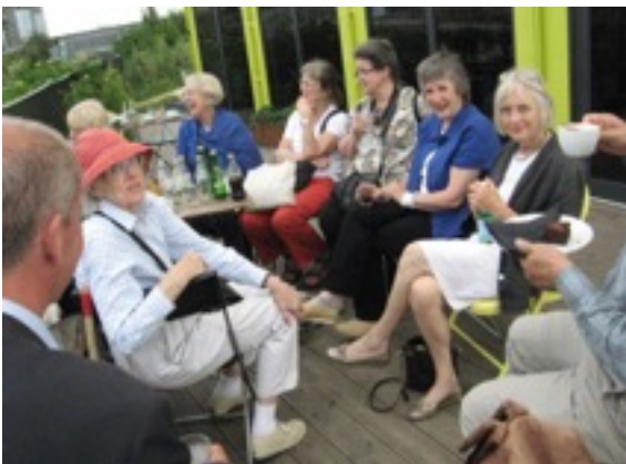
But the tea afterwards was good...

GHS members enjoy a special preview tour of the Olympic Park which is under construction. Charles Boot captures the sheer glamour of the day with an evocative if lengthy description in the GHS news : 'Approaching the Hockey Centre the bus turned around and luckily got stuck behind a bin lorry, which slowed our progress...'