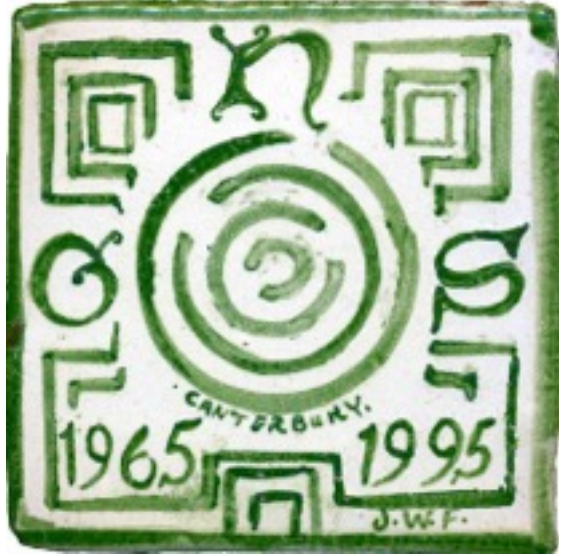
Commemorative tile presented to members attending the 30th anniversary AGM

Regency gardens, and there are study days on Georgian gardens and on gardens and orientalism. Visits include Hawkstone, Osborne House, Greenwich Park and Highgrove. There are tours to North West America, and to Campania and Sicily. The AGM is at the University of Kent, Canterbury.