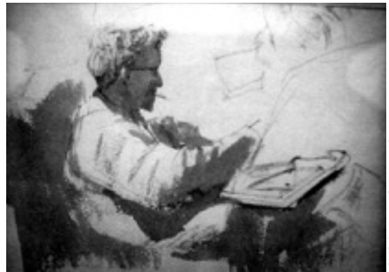
GHS Archive, Cowcross Street

The first annual conference and general meeting of The GHS is held on June 4: a one-day event held at