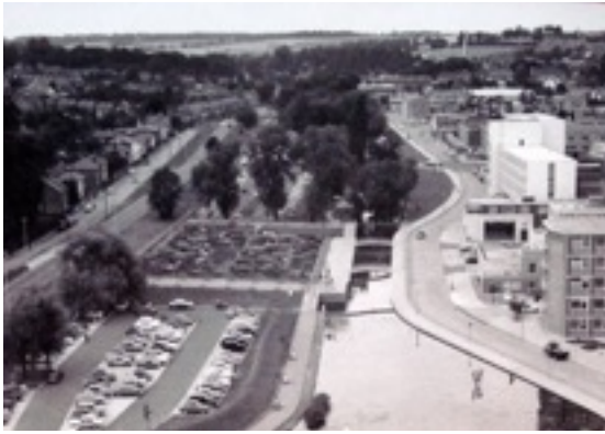
Landscape Institute Library, MERL