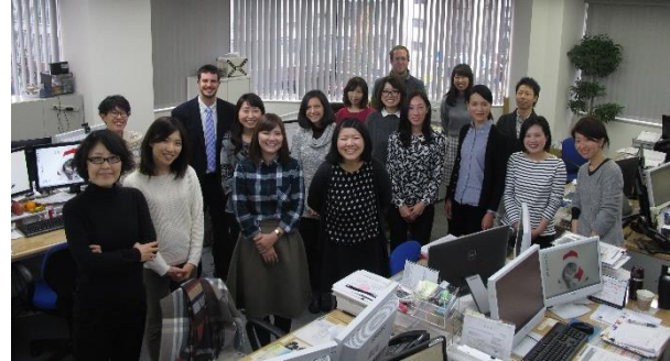
Japan Office Nagoya