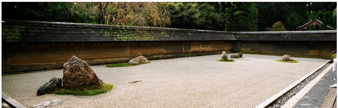
(Ryoanji Rock Garden)

In this world-renowned rock garden, 15 stones, which vary in shape and size, are laid out in an exquisite balance. Despite its limited size, the garden expresses infinite space. This is the supreme example of a dry landscape garden.