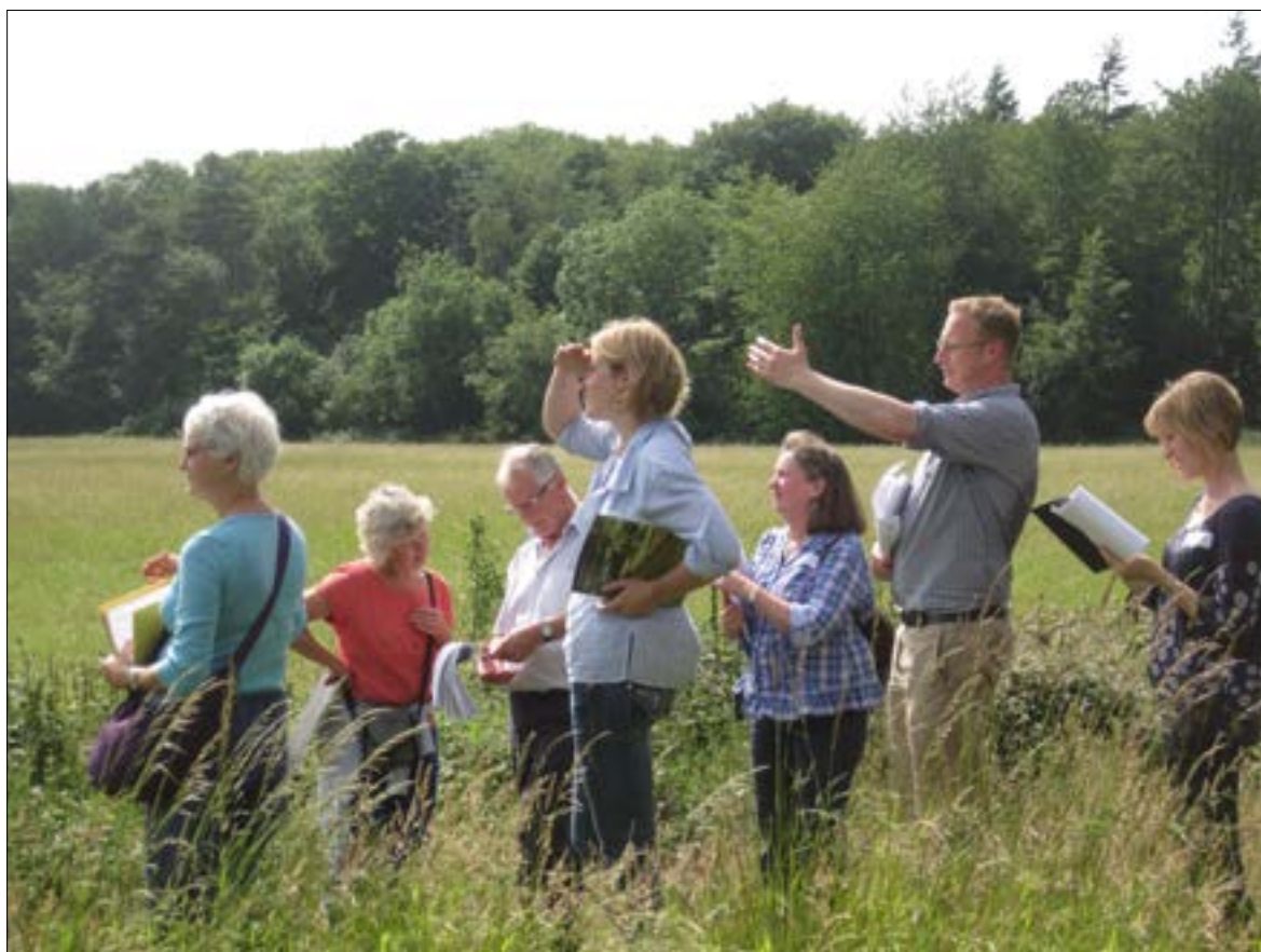
Surveying the parkland - Greys Court, Oxfordshire - June 2012

The project found useful applications for the P&GUK database but this is hampered to some extent by the inconsistent input of research information by CGTs. Certainly NE officers could usefully refer to it in the early stages of determining HLS applications. Whilst the HLPO promoted the use of the website and urged CGTs to input data onto it, P&GUK were not in a position to take advantage of the opportunities of the HLP at the time. Now that P&GUK have a revised strategic plan, the feedback from the HLPO can be of practical use in developing this further.