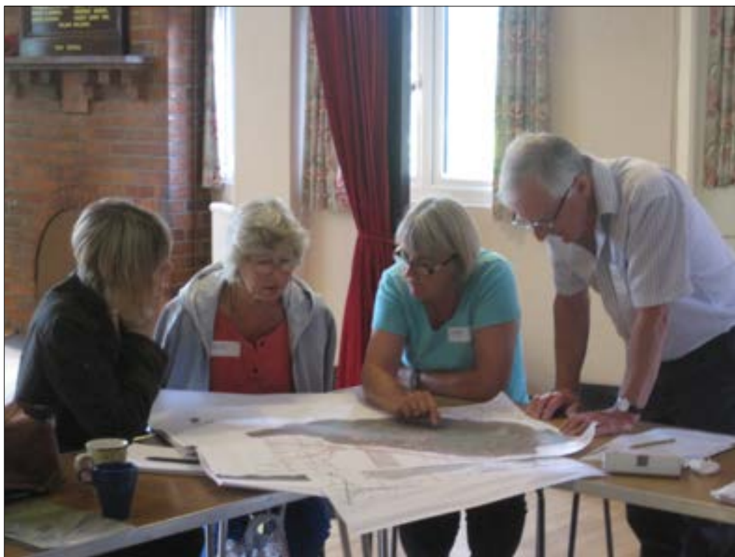
Identifying parkland features – September 2012