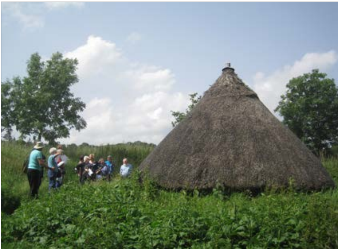
C19 ice house, Greys Court, Oxfordshire – June 2012

It was also hoped that the existence of Conservation Management Plans (CMPs) or parkland plans would emerge during the exercise and could be noted on the spreadsheet but this information is by no means readily available. In the last year of the project, the Garden History Society (GHS) was commissioned by EH to undertake this study separately. Sharing such information should help to ensure that research efforts by CGTs are targeted and not unnecessarily duplicated for the purposes of recording essential conservation information (academic study and/or publication being a different issue).