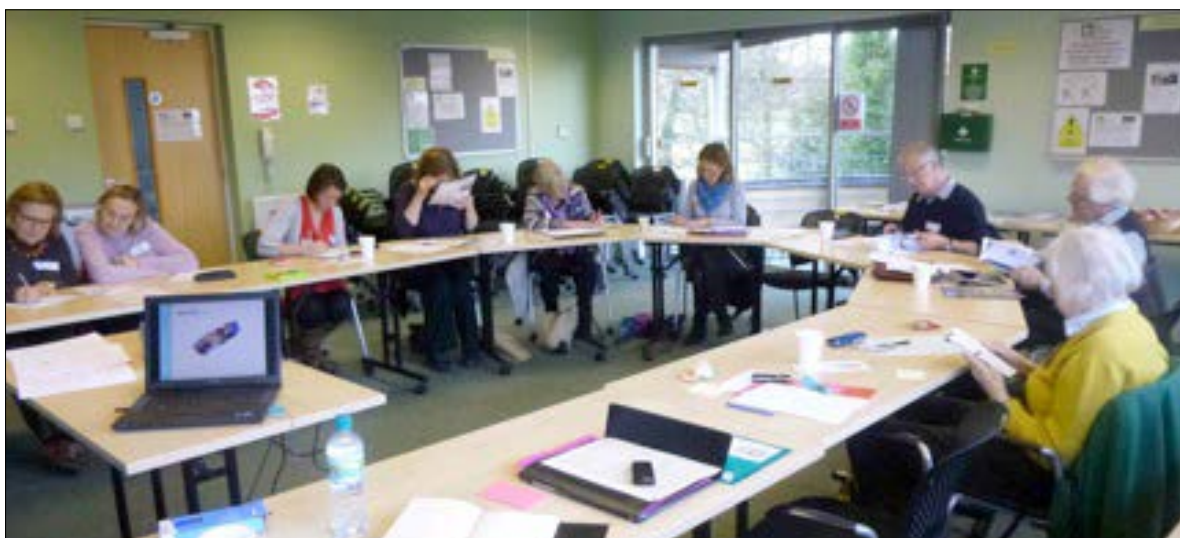
Studying CGT promotional materials at Regional Forum, Basingstoke - November 2012

The Web Forum can function well as an area of pooled resources for occasional use, but the continued development of a culture of information sharing through pro-active encouragement by AGT and other stakeholders could maximise the potential of learning from the practice of others.