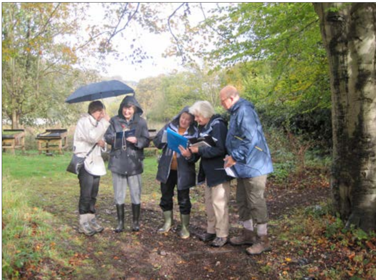
Checking the maps - Juniper Hall - October 2011

This project has been evaluated against the original outcomes set in April 2010; it is acknowledged that there is considerable overlap between these outcomes and this is reflected in the narrative. Outputs and outcomes have been gathered through the course of the project via the quarterly monitoring reports and these have been drawn on to assess activity and delivery against the overall expected outcomes. Delegates on each training course were asked to complete a training evaluation report. The original data on structure and membership was collected again and comparison made. In addition, CGT Committees in the region were asked to complete a questionnaire on their experience of the project from their strategic perspective.