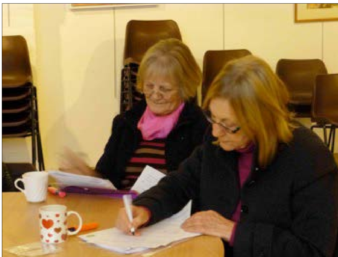
Giving feedback – London – December 2012

Costs for printing of materials was over and above this and varied considerably from course to course. One problem encountered was the full colour and glossy nature of the EH guidance booklets. Few EH publications are now produced in hard copy but as pdfs available for download. The EH 'Local Listing' guidance is 35 pages in full colour blocks with photographs, making them prohibitively costly to print. The HLPO and trainers felt that volunteers were more likely to read a hard copy than read it on screen. The HLPO therefore contacted EH to raise this issue and received a version with the colour blocks removed; a far more practical proposition for printing and it is hoped that EH might now produce such versions as standard practice.