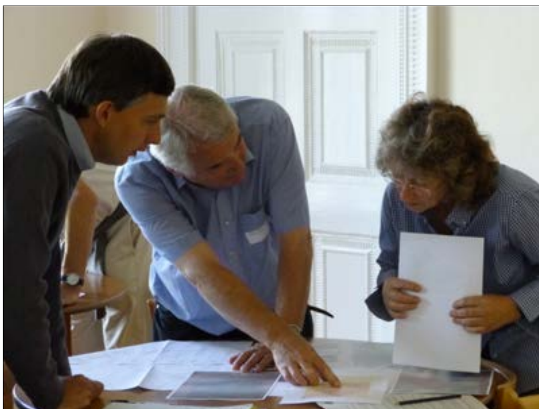
Interpreting old maps - Padworth House, Berkshire - September 2012

The resources for responding to planning applications tend to be increasingly web-based. After trial and error with unwieldy quantities of printed materials for the Planning training course, the HLPO took the decision to print a minimum of handouts and then give further resource material to each candidate on a CD. This has not yet attracted negative feedback. The course was also supplemented by hard copies of booklets on planning issues published by the Campaign to Protect Rural England (CPRE) which formed the basis of the course.