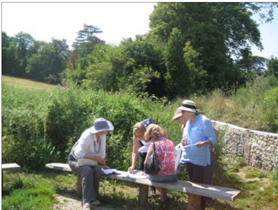
Training to identify and record site features - Juniper Hall, Surrey - July 2012