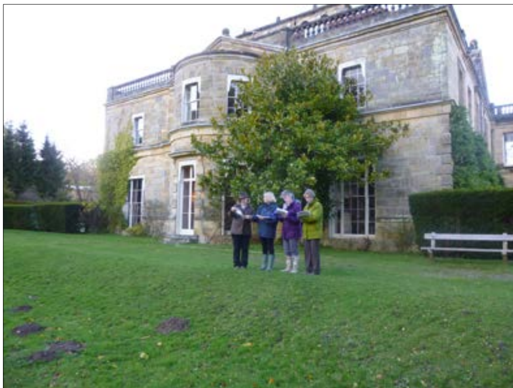
Preparing for site survey - Kidbrooke Park, East Sussex – November 2012