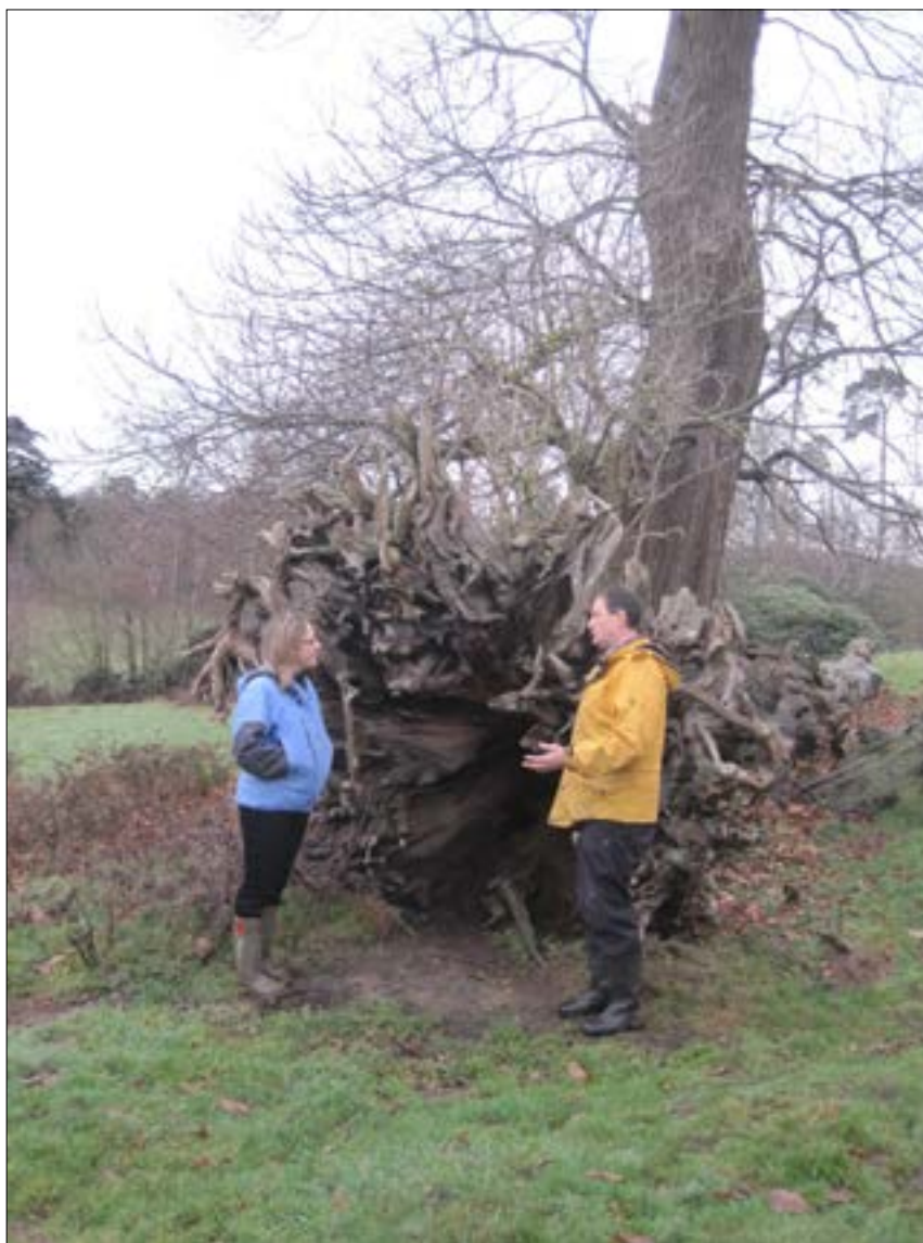
Contemplating remnants of Repton's beech clump Kidbrooke Park, East Sussex - January 2012