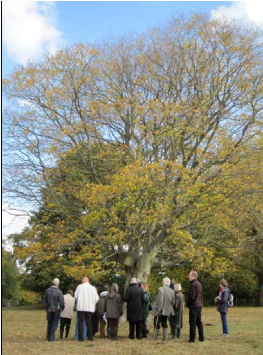
Tree identification in parkland with Kent Gardens Trust - Godinton Park, Kent - October 2011