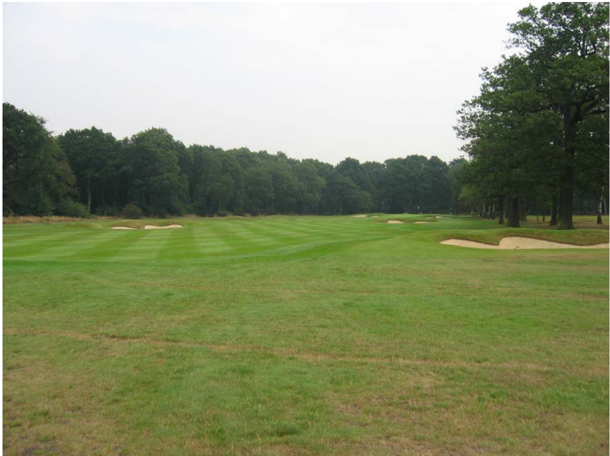
Coombe Hill golf course

Location: Inland. Either as naturally occurring woodland or as manmade plantation.