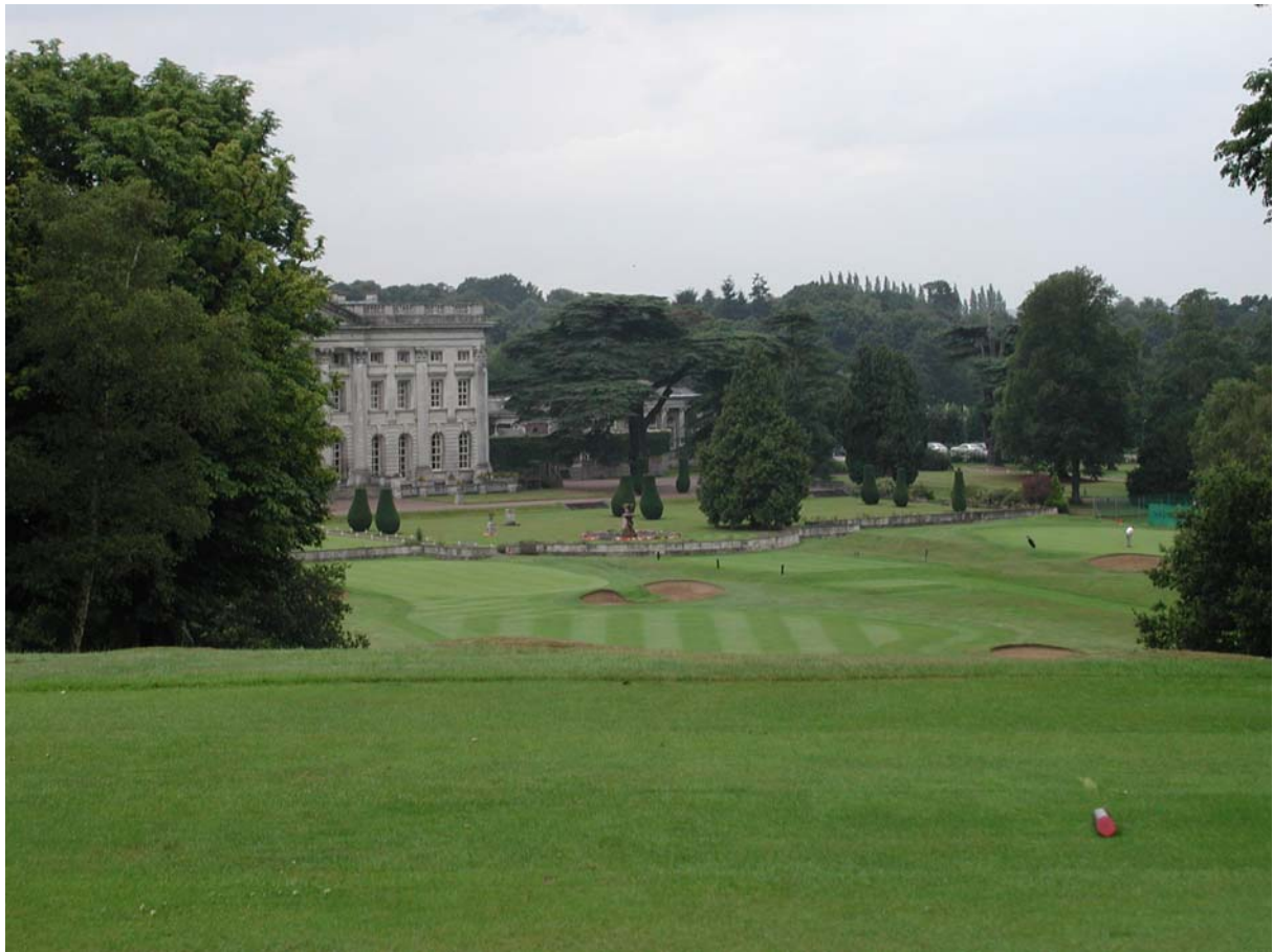
Moor Park golf course

Location: Mainly inland. Traditionally planned as the landscape setting for large country residences and as hunting grounds. However, purpose-made parkland landscapes have also been created around golf courses since the two often fit very well.