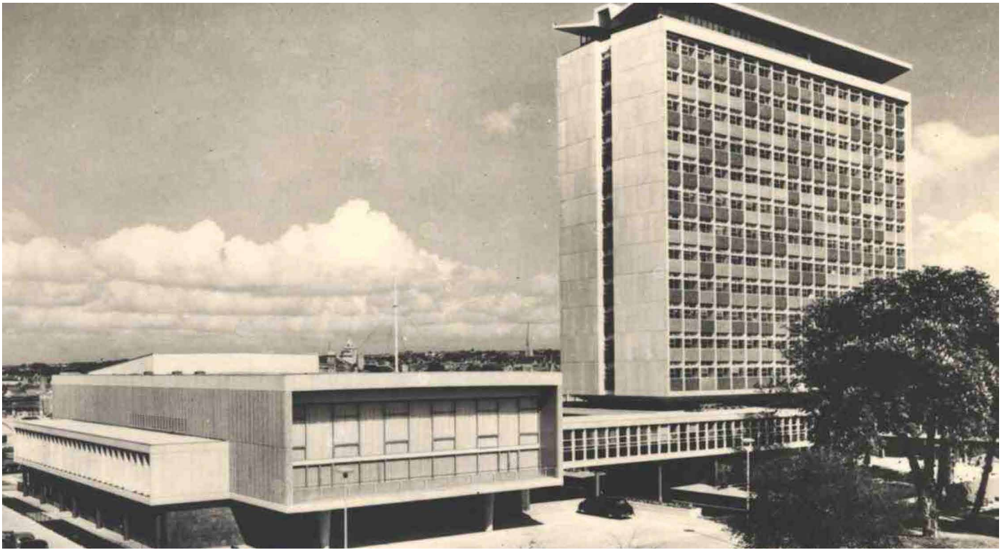
Fig 11. Plymouth's Grade-II registered Civic Square (originally named the Great Square) was designed by Geoffrey Jellicoe as part of the city's post-war civic reconstruction and

laid out 1957-62. Jellicoe intended his design to embrace 'dignity and frivolity', and the hard landscaping incorporated a wide variety of materials.