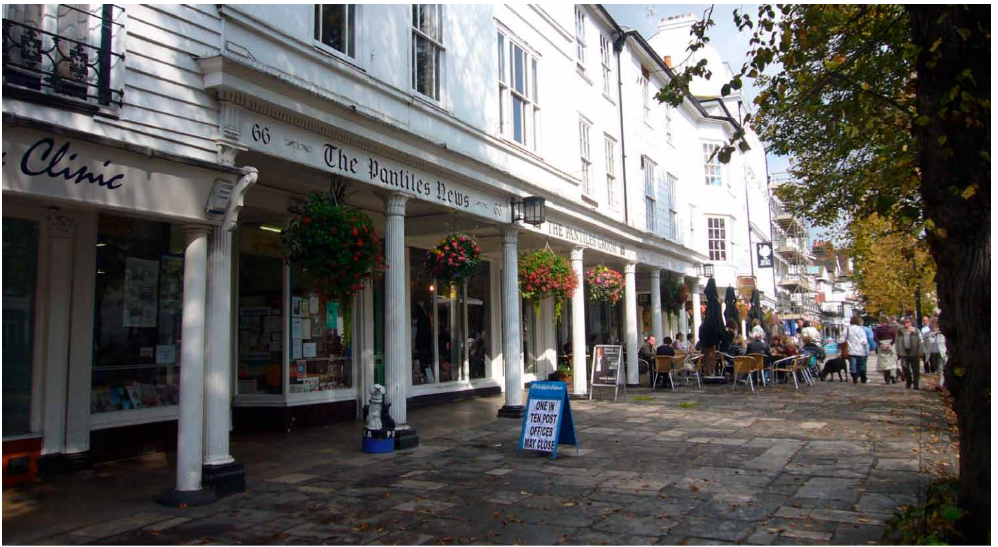
Fig 1. The Pantiles, Tunbridge Wells, Kent. A grass walk between a double row of trees was laid out as early as 1638. Here the company walked in intervals between taking the waters.

By the 1680s tradesmen's stalls had become permanent shops behind a colonnade, and the former walk paved over: its built-up character means designation is via listing, not registration.