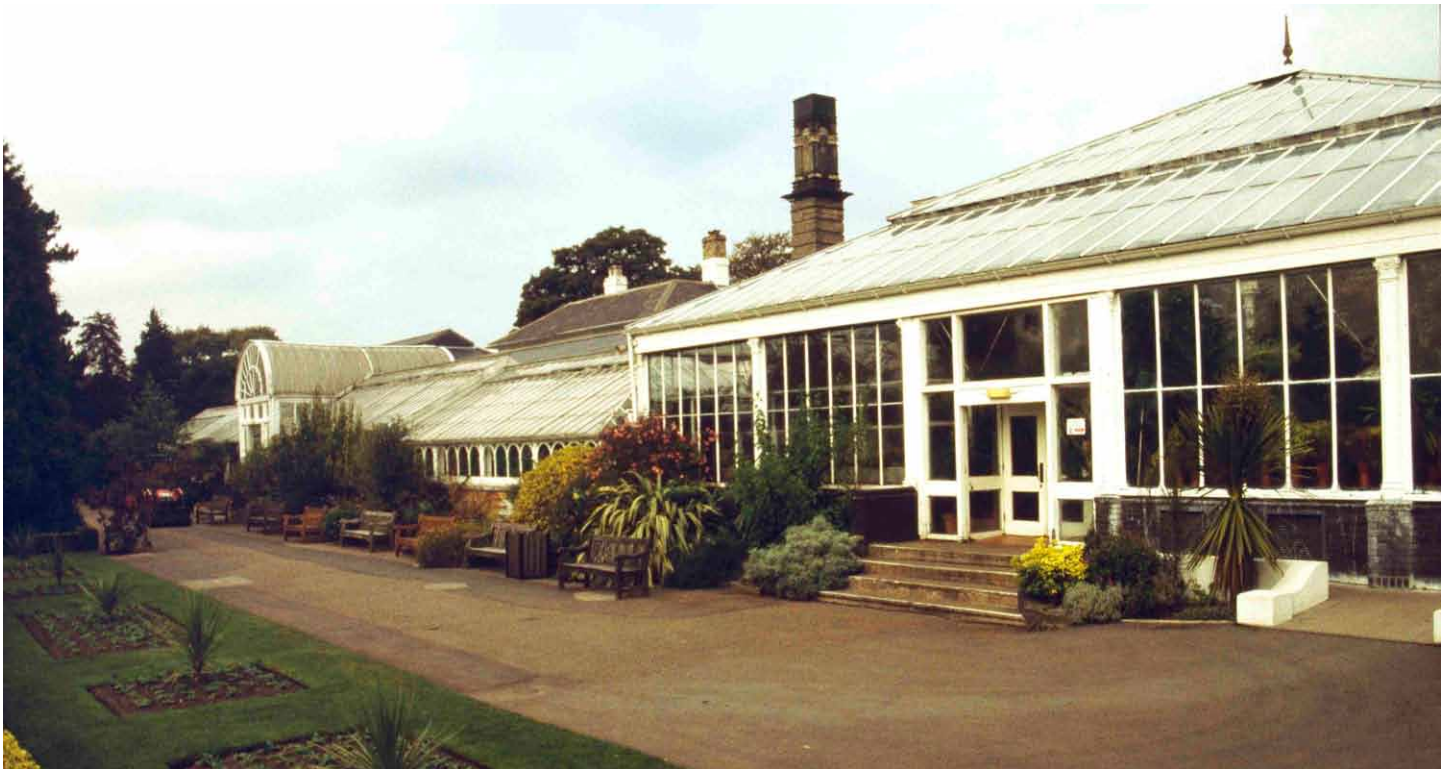
Fig 4. Birmingham Botanic Garden (registered Grade II*) opened in 1832. The general plan, by J.C. Loudon, did much to disseminate his ideas on gardenesque layouts and plantings in the Birmingham area. The range of glasshouses includes (nearest the camera)

the Grade-II listed Palm House of 1871; the Orangery; Tropical House, Cactus and Succulent House lie beyond.