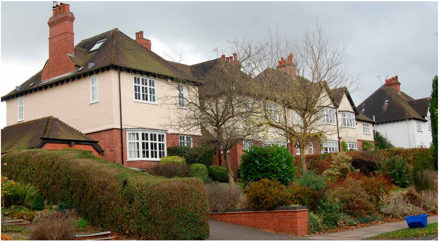
Fig 9. Moorpool, Harborne, Birmingham. A private housing estate of 1908-13, in which gardens and public green spaces were, and are, important. Registration is generally

unsuitable for such places; Conservation Area designation, however – which Moorpool enjoys – can help maintain the estate's particular character.