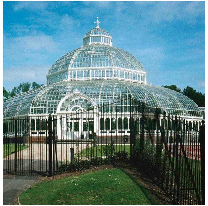
Fig 6. The Palm House (listed Grade II*) in Liverpool's Sefton Park (registered Grade II*), opened in 1872. Although the most prestigious of the city's 'ribbon of parks', its completion was protracted, and plans for a botanic garden were abandoned. The mound on which the conservatory of 1896 stands (accompanied by six statues of worthies) was originally intended for a bandstand.

visible; and that views should look inwards from the perimeter carriageways – ambitions only possible in the larger parks.