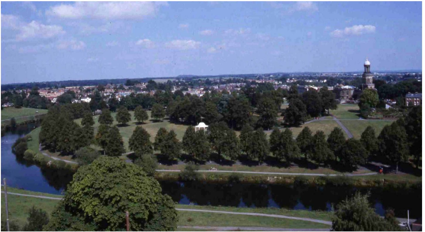
Fig 3. The Quarry, Shrewsbury, Shropshire. A large area of common grazing outside the town walls, this began to be appropriated as a polite space in 1719 when tree-lined walks were

planted. Tensions remained throughout the eighteenth century between graziers, quarrymen, washerwomen (who used it as a drying ground) and leisure users. Registered Grade II.