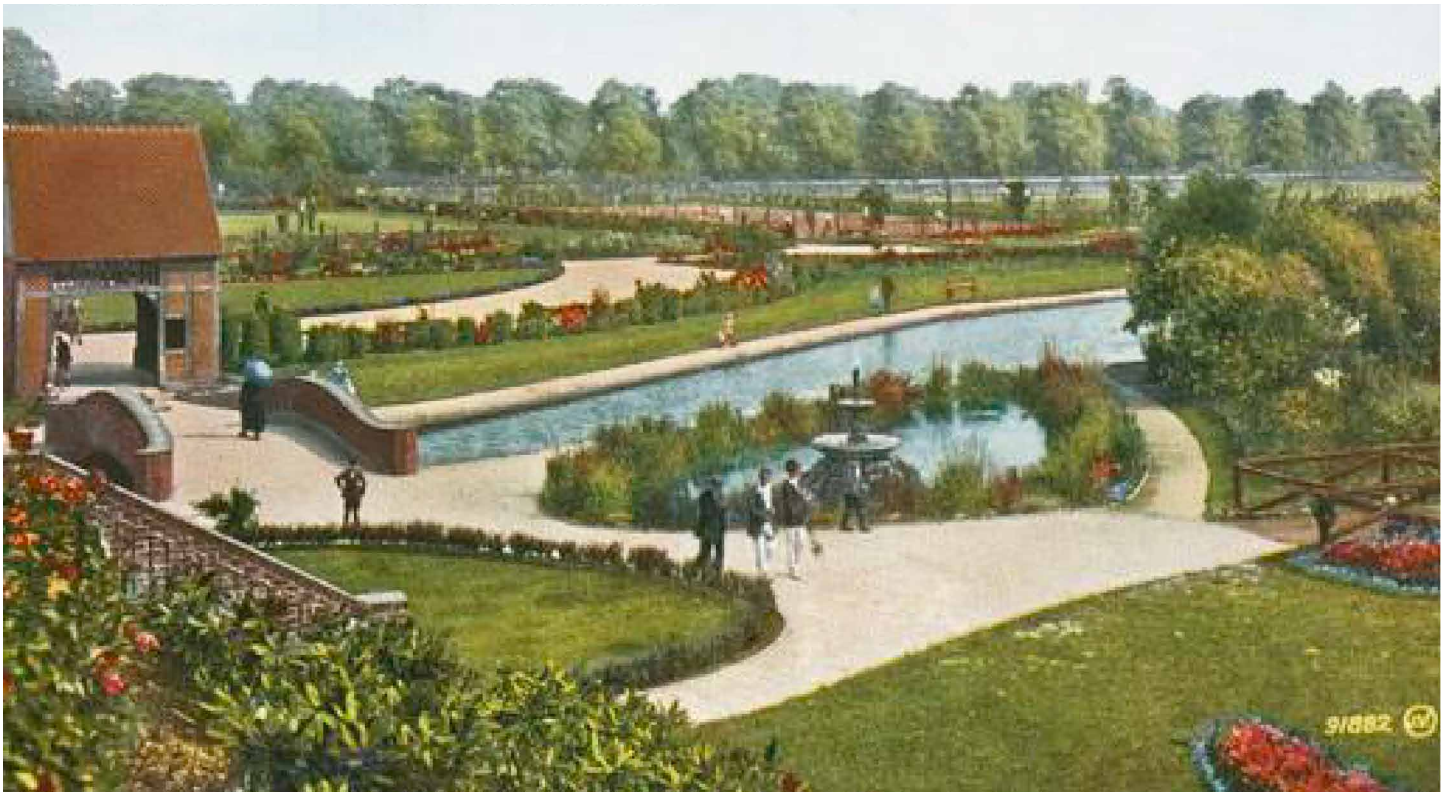
Fig 8. Rowntree Park, York. Opened in 1921, an example of a memorial park, gifted to the City of York by the Rowntree family in memory of members of the York Cocoa Works

staff who fell and suffered during the First World War. Registered Grade II.