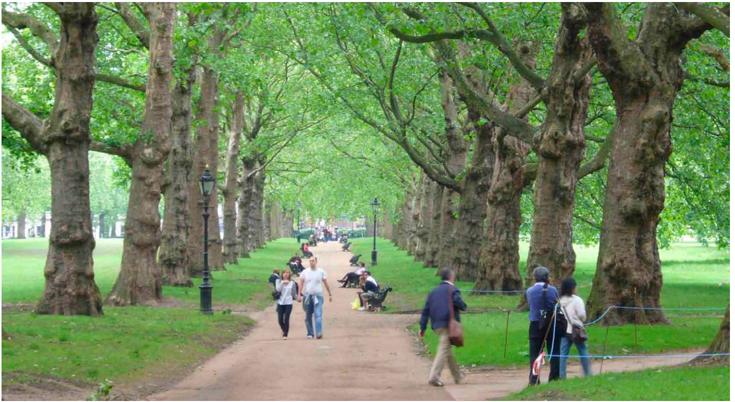
Fig 2. Green Park, London. Until the Restoration of the monarchy in 1660 this was open waste or meadowland. King Charles II enclosed the ground with a high brick wall to form

a deer park and the area became known as Upper St James's Park. It was opened to the general public in 1826. Registered Grade II*.