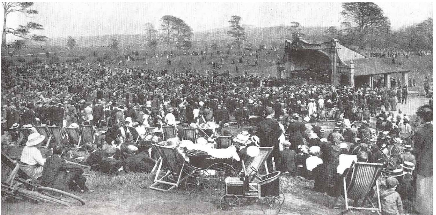
Fig 7. A band performance, Heaton Park, Manchester, 1914. Towns and cities often made great efforts to organise activities in their parks. In the late nineteenth century Manchester placed great store on musical entertainments, and from 1921 began to invest in new, enclosed and sunken bandstands. Registered Grade II.

Purpose-designed memorial parks were also created, such as Fleetwood Memorial Park in Wyre, Lancashire, created in the 1920s by Patrick Abercrombie, and the Walsall Memorial Garden, opened in 1952 to a design by Sir Geoffrey Jellicoe (both registered Grade II). The Fallen were also remembered through civic landscaping schemes; in Colchester (Essex) an Avenue of Remembrance was planted in 1931-2 along its western by-pass. Landscapes of Remembrance , more generally, are considered in a separate designed landscapes selection guide.