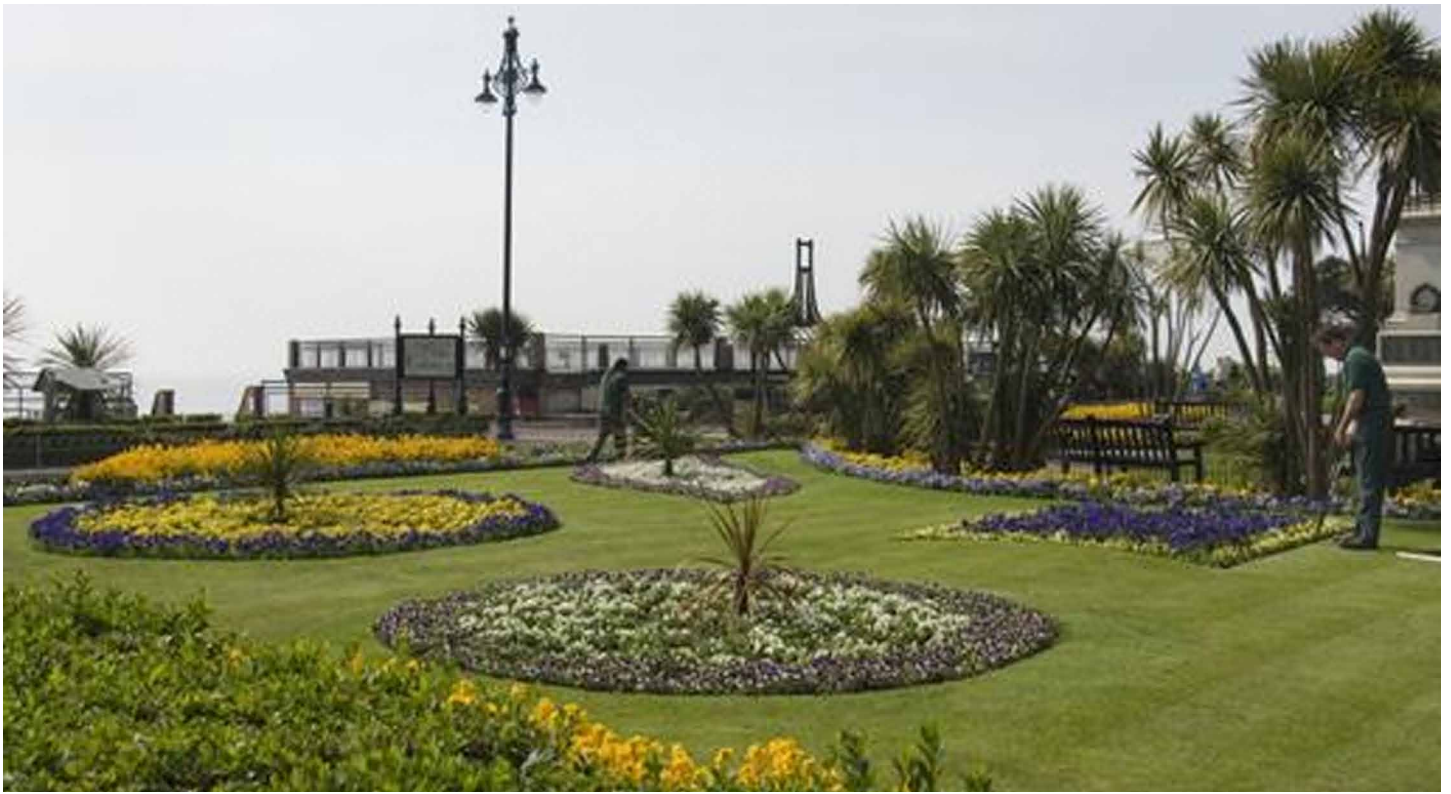
Fig 10. Clacton developed as a resort in the mid nineteenth century, and pleasure grounds and cliff-top gardens were laid out in the 1870s. In 1921 the council spent 'considerable

sums ... laying out gardens, providing shelters etc', and Marine Gardens (seen here) were laid out overlooking the pier to designs by the County Surveyor: Registered Grade II.