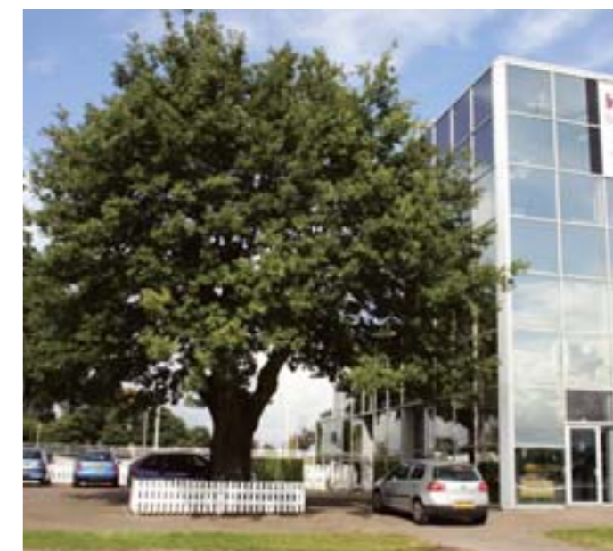
National Agricultural Centre, Stoneleigh: this veteran oak has been retained to enhance this new glass office block. It will also help to shade it to alleviate impacts of climate change. However, the future size and growth of trees needs to be considered at the design stage of the development as the canopy of this tree is touching the glass.