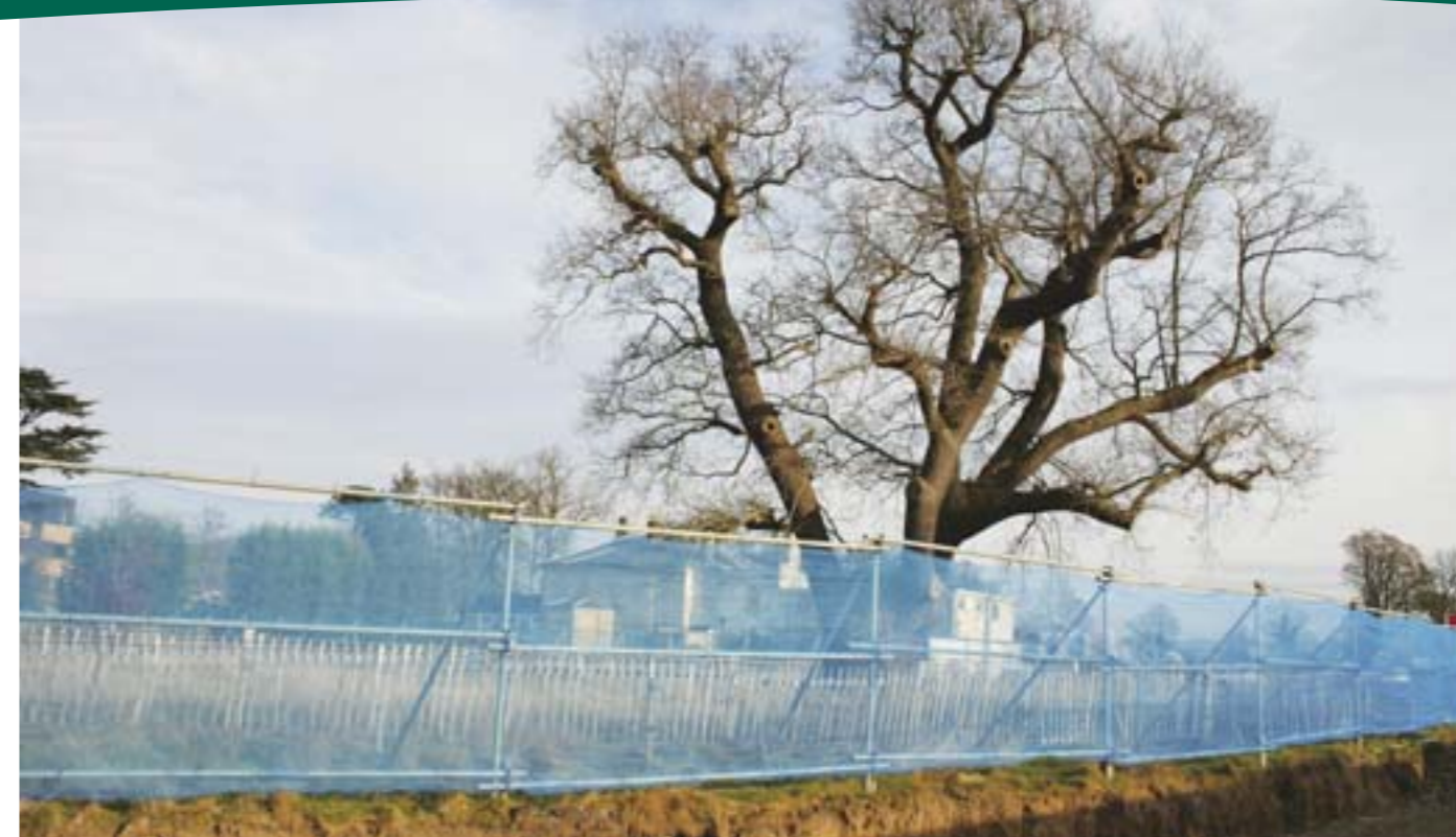
Substantial fencing has been used according to BS 5837 Trees in relation to construction, to protect the roots of this old pollard estimated to be 500 years old.

To protect a tree during construction local planning authorities are guided by the recommendations in British Standard 5837: 2005 'Trees in relation to construction'.