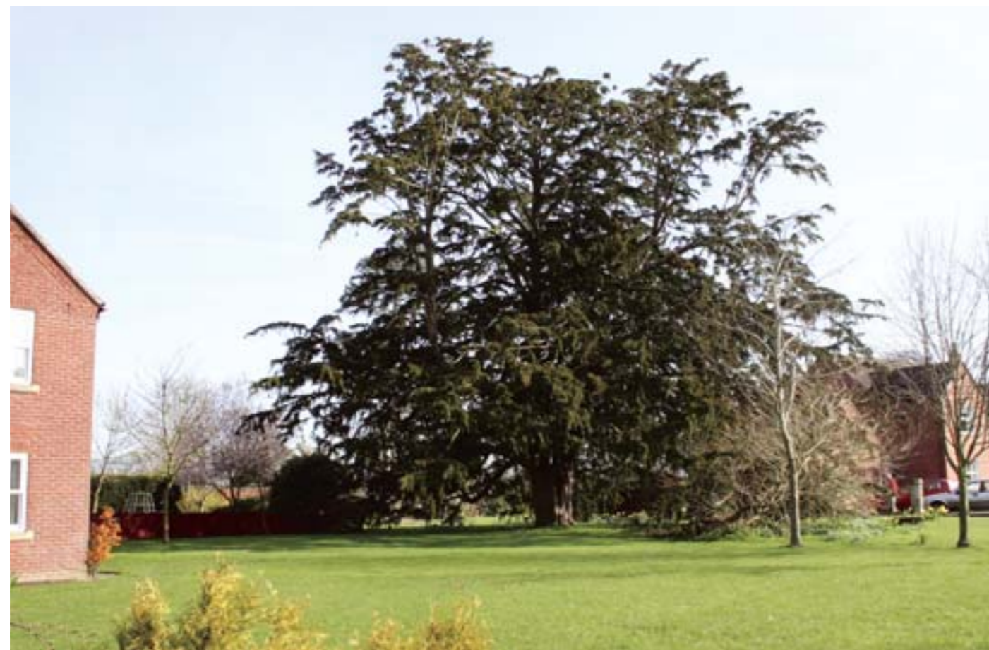
This small, private estate is built around a special yew that occupies a whole plot because the developers believed it added so much value.

Ancient and veteran trees are special because of their great size, age or condition. Retaining these trees will enhance the value of any development. They will add a unique quality, giving it a sense of place or an 'air of respectable antiquity', creating character and distinction which will be appreciated by potential owners and their families.