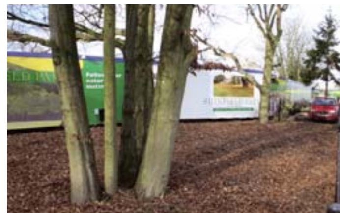
They have used the trees to promote their scheme on billboards and in their marketing.

The developers have made full use of the parkland ancient and veteran trees to enhance their major development.