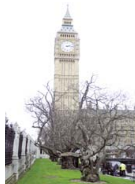
House of Parliament: these ancient catalpas watch the passing of time under one of our most historic buildings. Ancient or veteran trees of any species are important.

An ancient tree is one that is old in comparison with other trees of the same species. The crown may be small as the tree is 'growing downwards' through age but may still be vigorous. It will have a very wide trunk relative to other trees of the same species. It is very likely that the trunk will be hollow. Even in this ancient stage it may stay alive for many decades and often centuries. The older the tree the more valuable it becomes for wildlife and as a heritage tree.