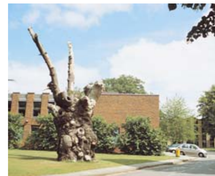
Brunel University, Egham: this ancient oak tree is so impressive, even though it is dead, the developers retained it right in the entrance to the university campus.

appropriate to take into account broader issues of amenity value or habitat for wildlife. Safety obviously takes precedence over amenity in general; but that does not mean that a tree must necessarily be felled. Skilled cutting which reduces weight in the crown or the sail area, may be necessary to retain trees as they age. There may well be other possible actions that will reduce the risk such as managing access around and under the tree.